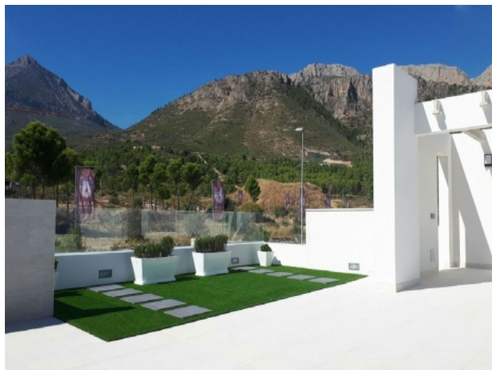
Garden with views to the surrounding mountains