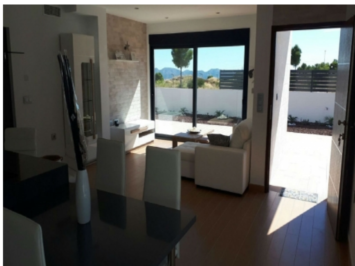
Living room with cosy sitting area