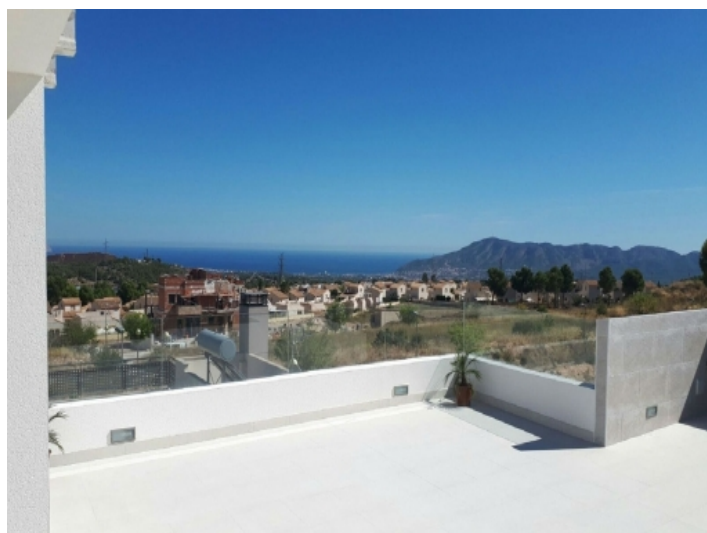
Roof terrace with views to the sea