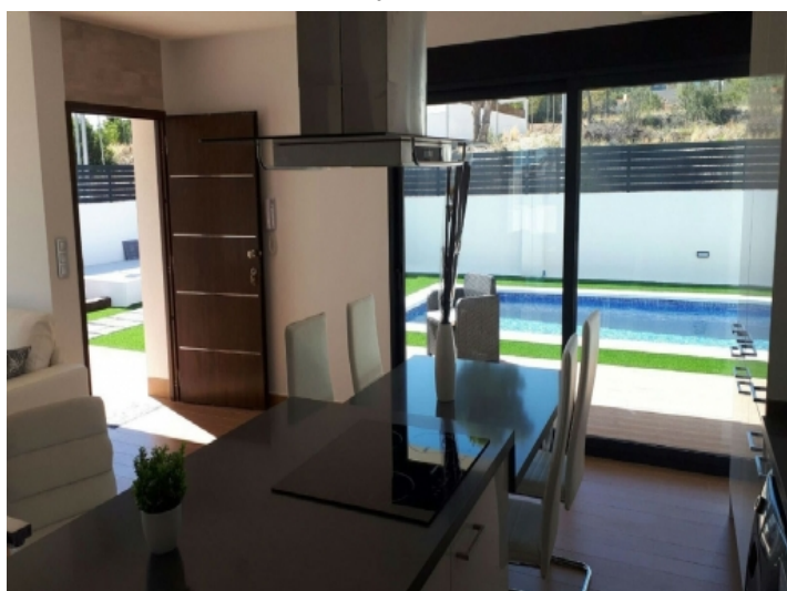
Living room with access to the pool