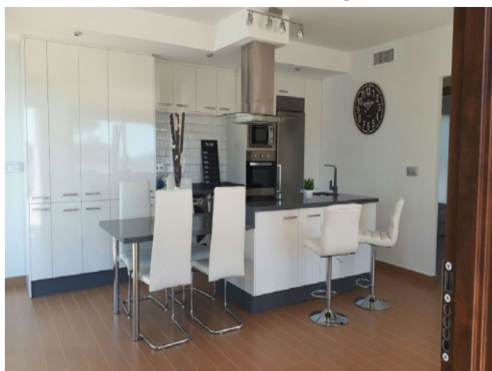
Bright and modern living room