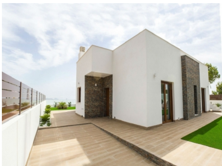
Entrance to the villa