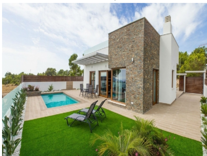
Terrace with pool