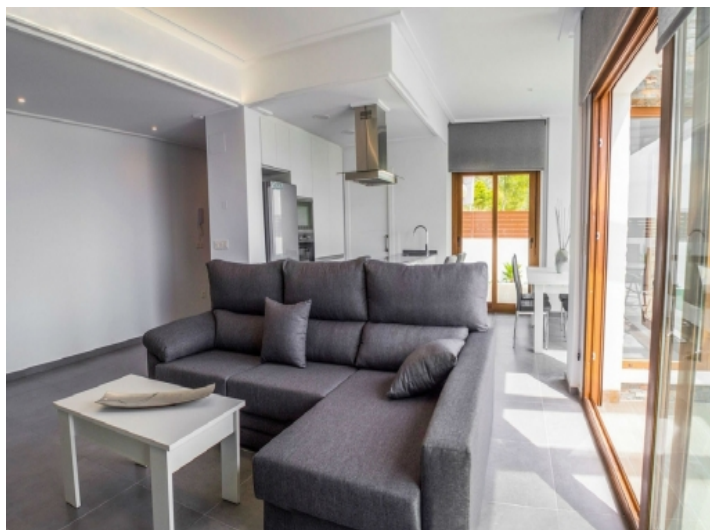
Cosy sitting area