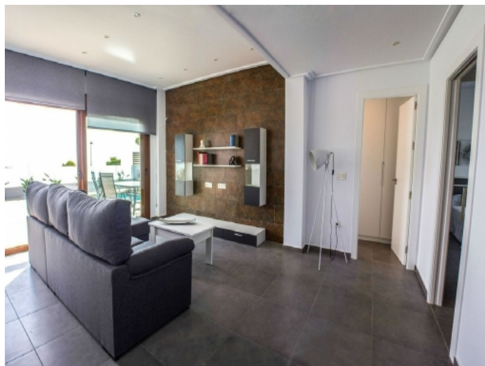
Modern living room