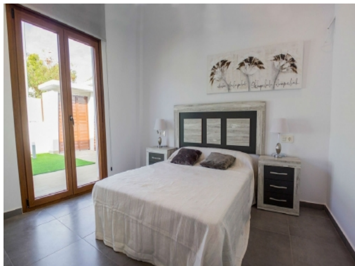
1 of 3 bedrooms