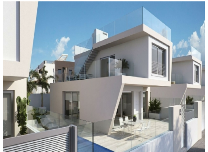
Preview of the terrace