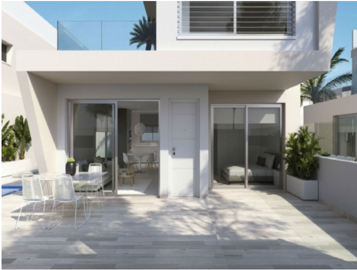
Preview of the terrace