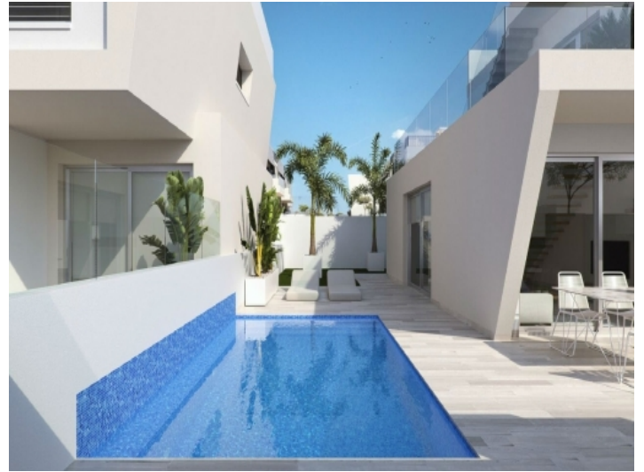
Preview of the pool