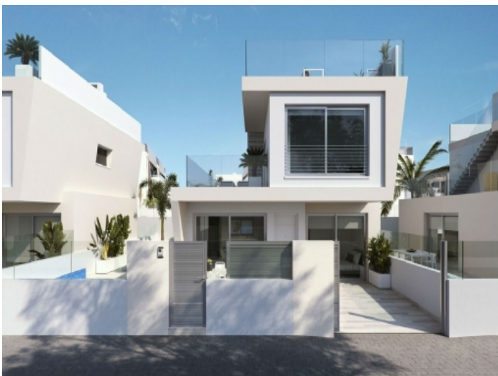
Front view of the villa