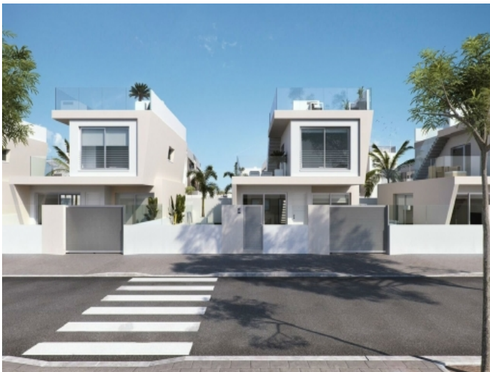
View from the street to the villa