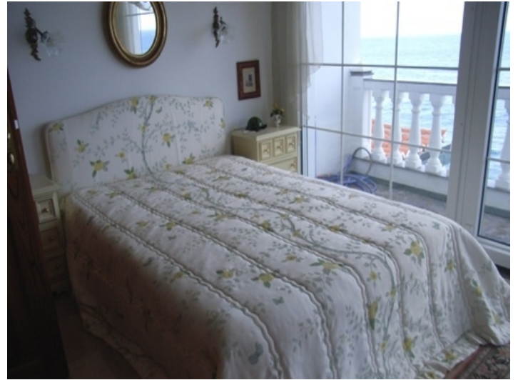
Bedroom with sea view