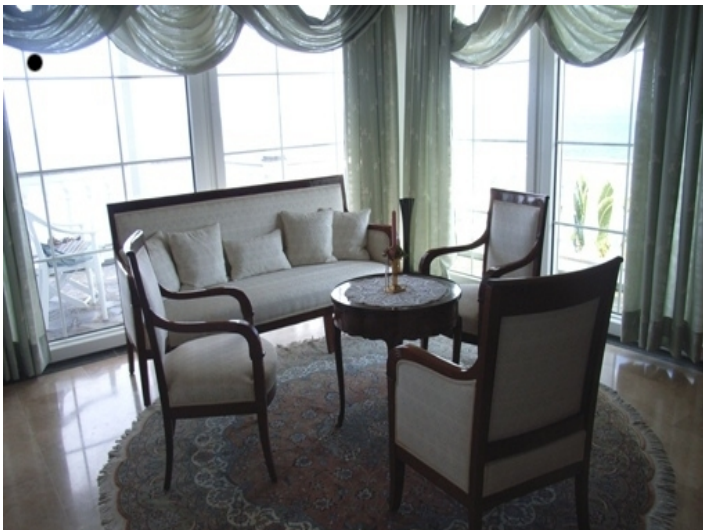
Sitting area with large glass front