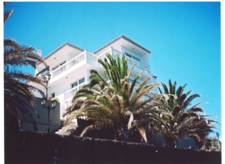
View to the villa from the sea