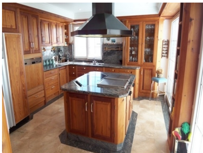
Noble fully equipped kitchen in untreated oak