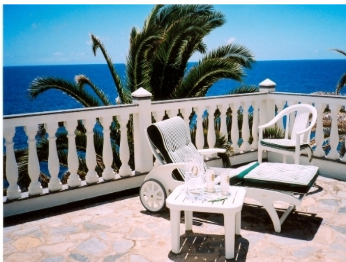
Terrace with stunning sea view