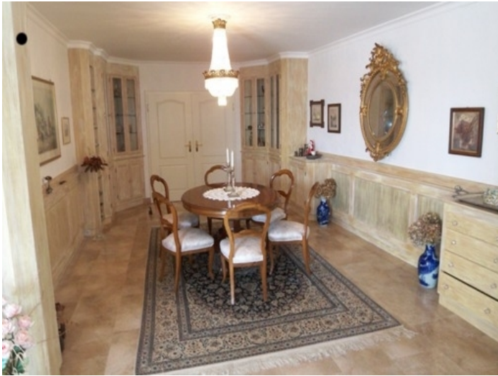
Dining room in a bright ambience with marble floor