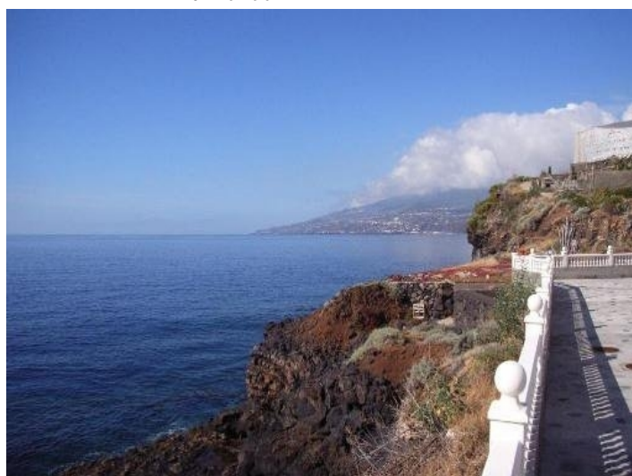
The sea and the coastal landscape