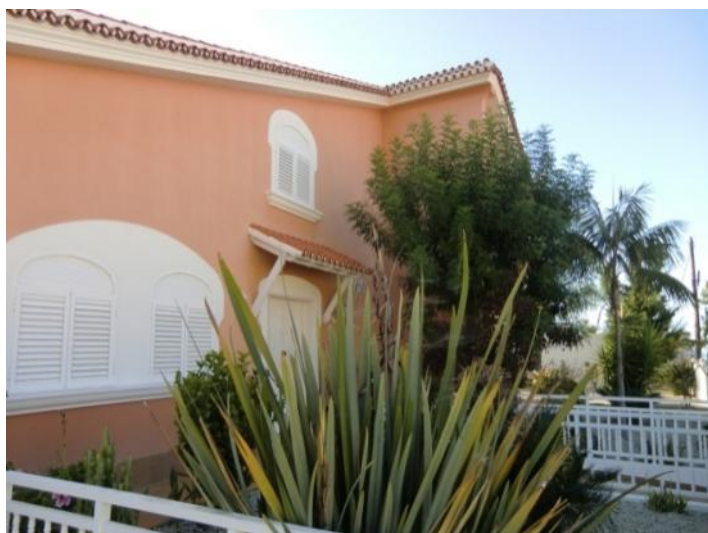
Access to the main entrance and planted front garden