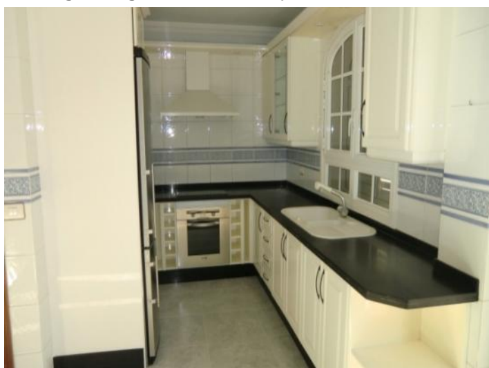
Stylish, fully equipped kitchen