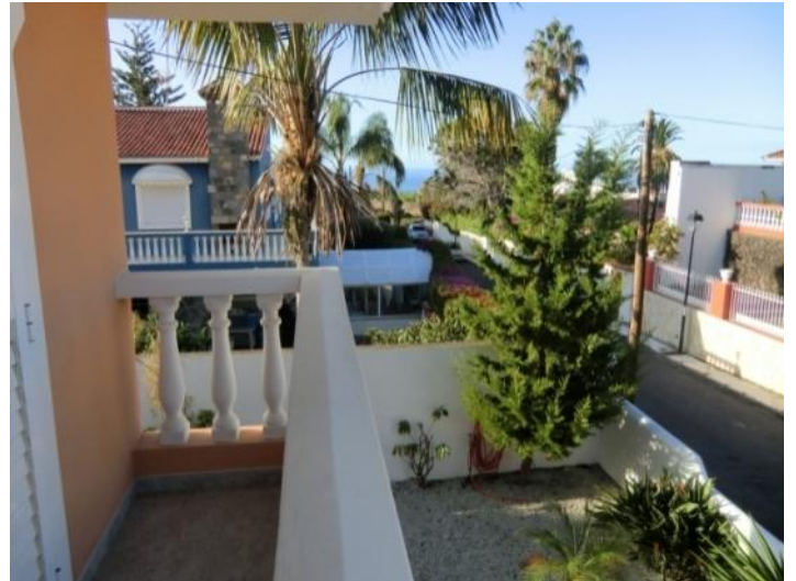
Balcony with sea view