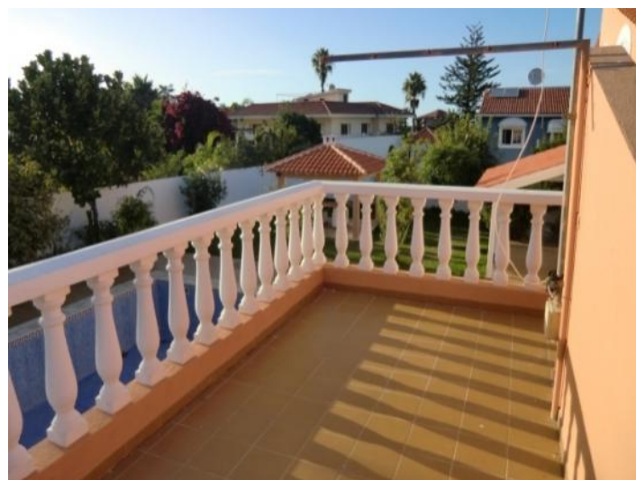
Beautiful view of the pool and the green area