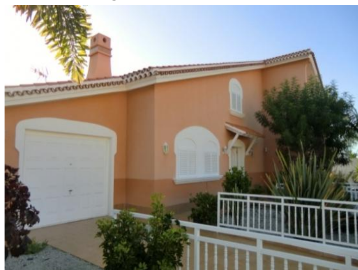
View of the front garden and the garage