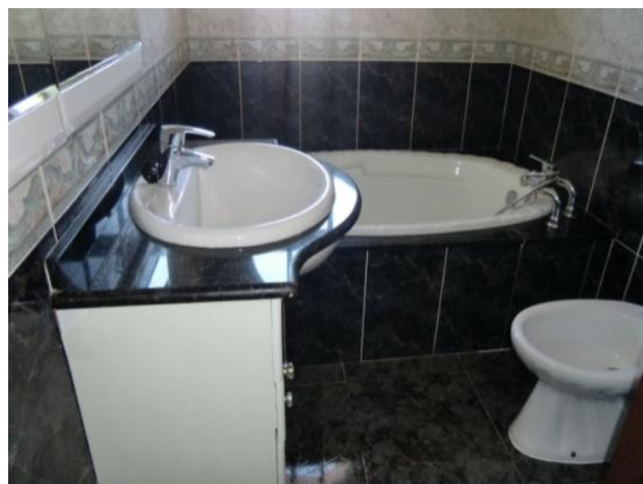
Elegant Bathroom with bath tub