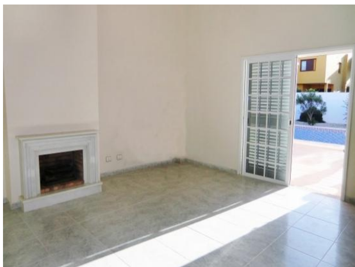
Bright living room with chimney and access to terrace