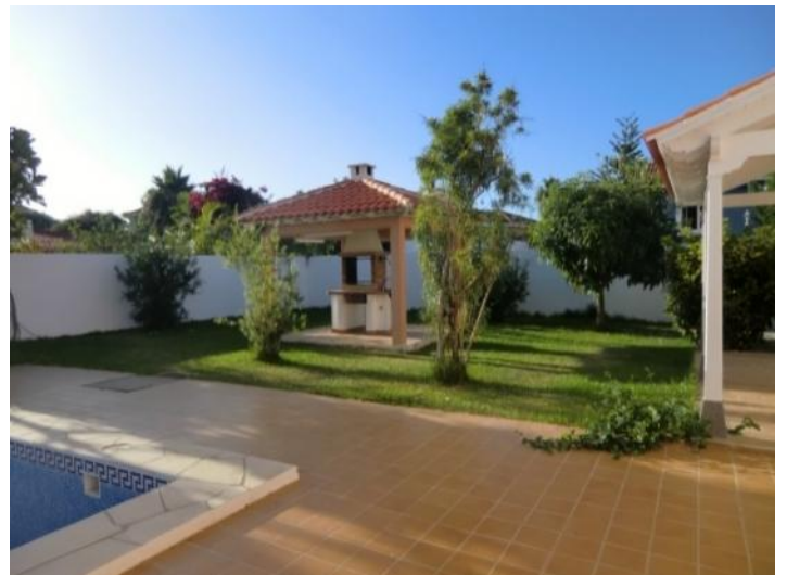
Large and covered barbecue