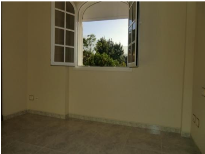
Another living room with luxury tiles