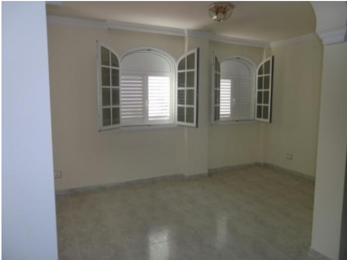
Friendly and bright living room