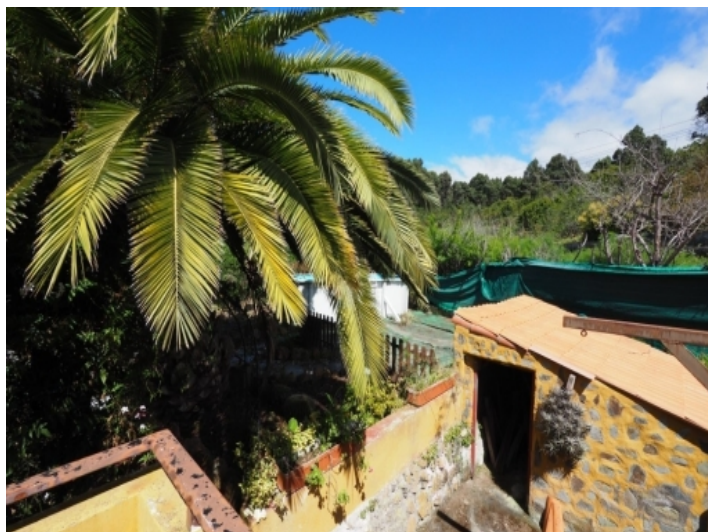
view from the roof