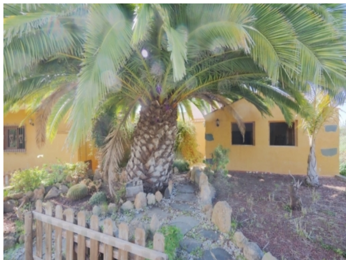
view from garden