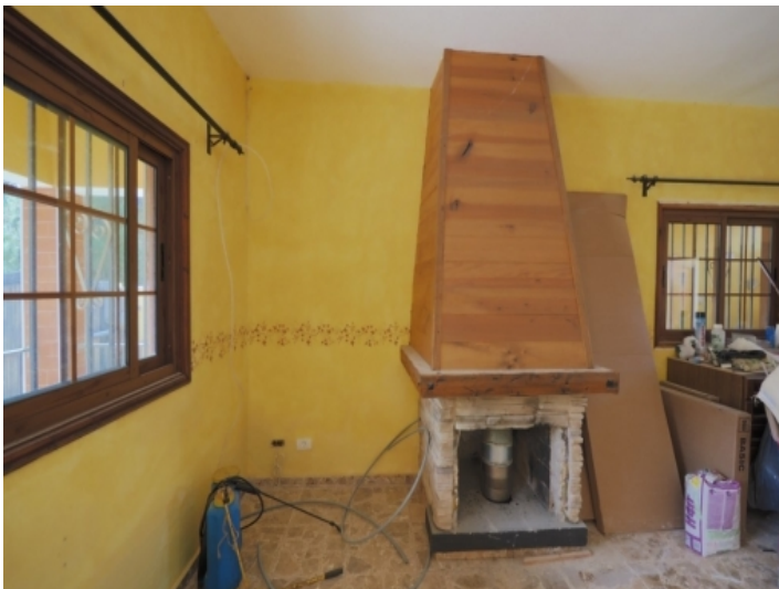
Chimney in living area of main house