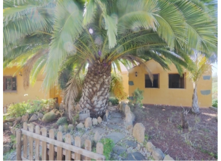
view from garden