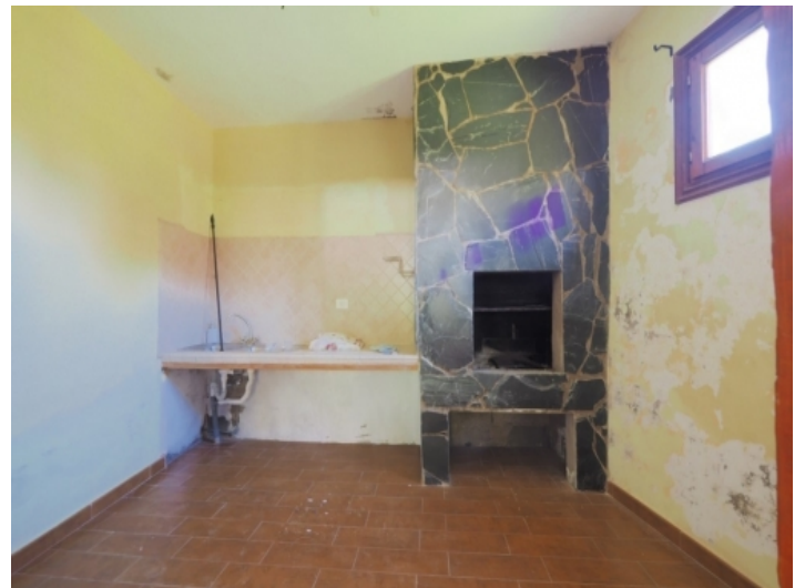
Kitchen in guests' house