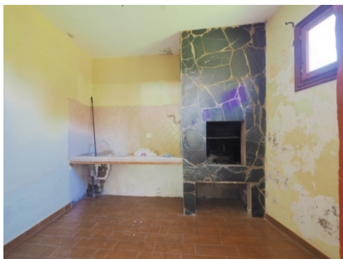
Kitchen in guests' house