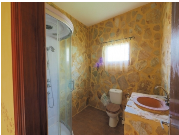
Bathroom in mainbuilding