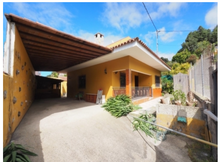
Carport and house front