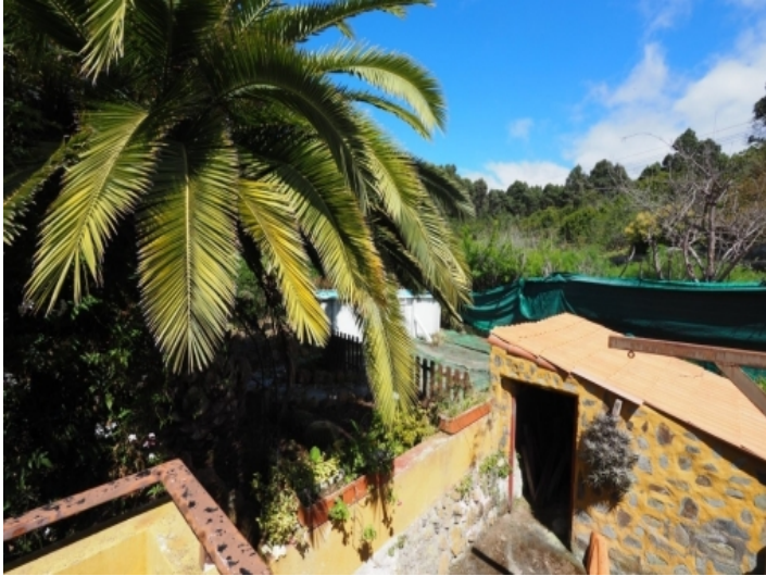
view from the roof