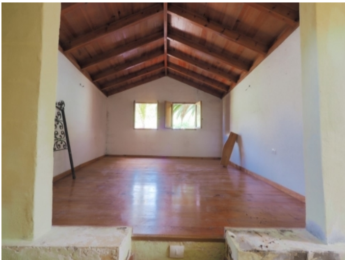
Bedroom in guests' house