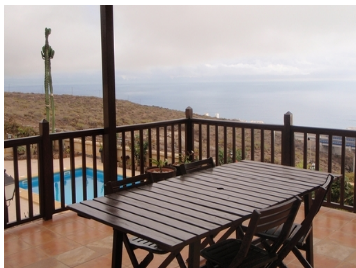
One of the large terraces overlooking the sea and the pool