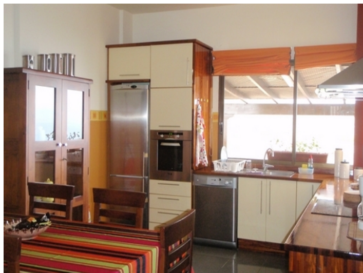
The modern kitchen with high quality built-in appliances