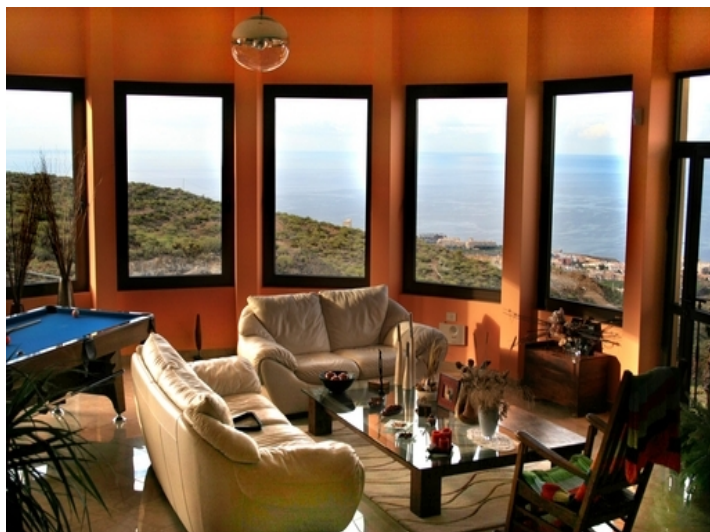
The living room with round panoramic windows and