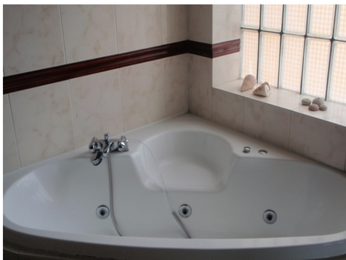
One of the bathrooms with bathtub