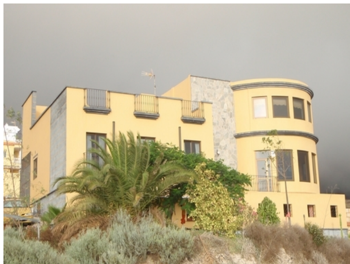
Exterior view of the stately villa