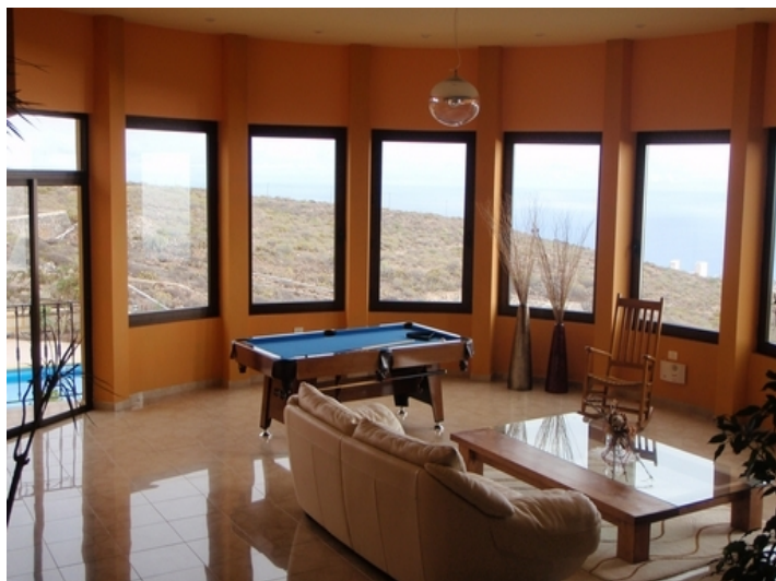
The salon with pool table and access to the terrace