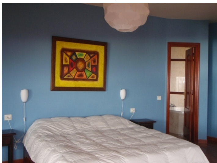
One of the bedrooms with bathroom en suite