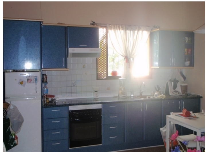
Kitchen in one of the guest apartments