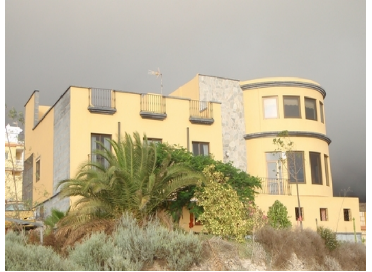
Exterior view of the stately villa