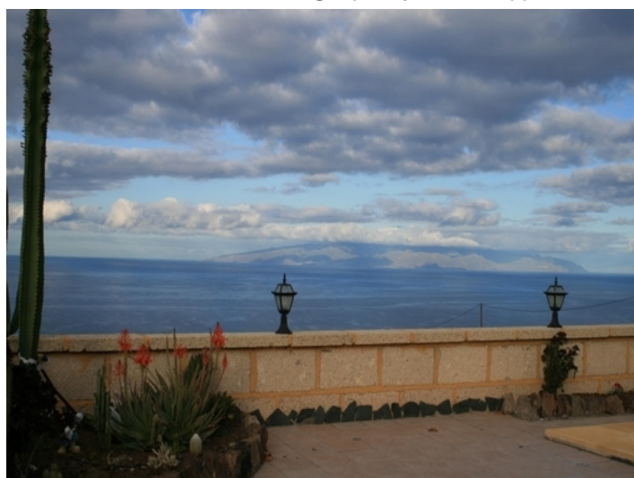
Wonderful views of the sea and the neighbouring islands