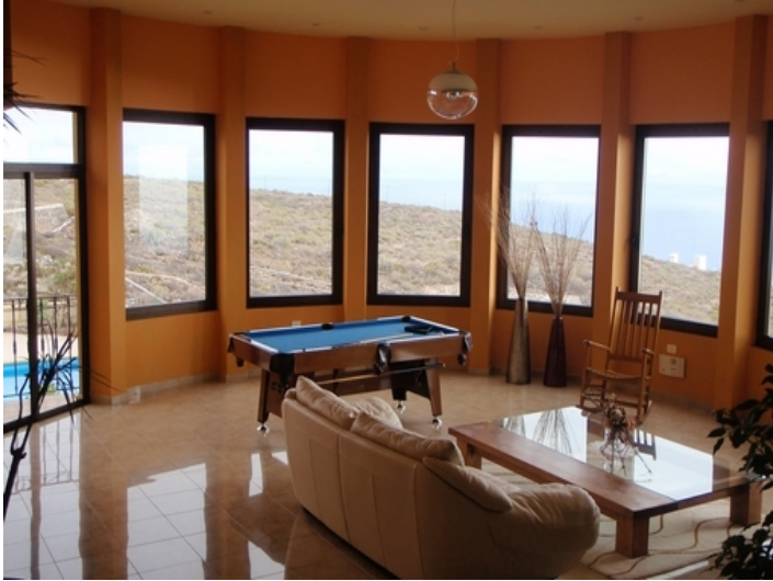
The salon with pool table and access to the terrace