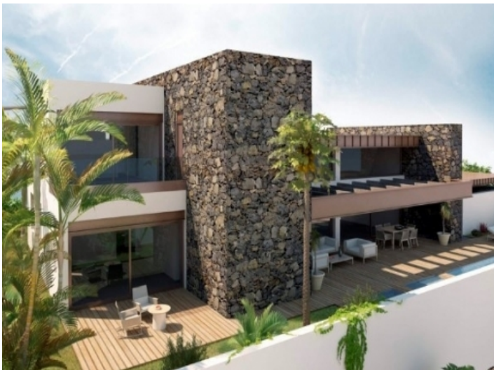
Villa with a lot of style and quality