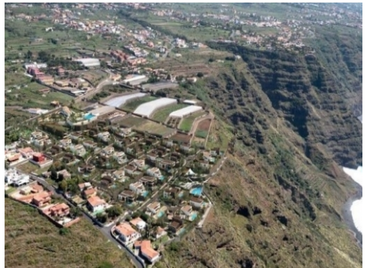
Nice views of the project