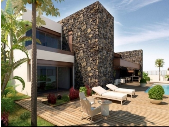
Exclusive construction project