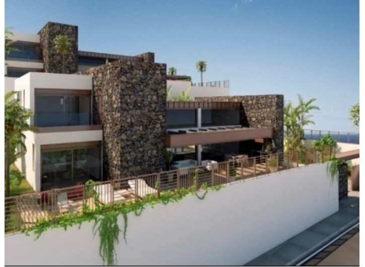
Quiet and privileged environment