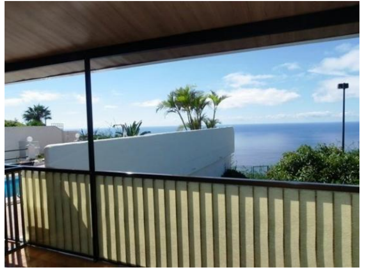
The sheltered terrace bedroom under the roof