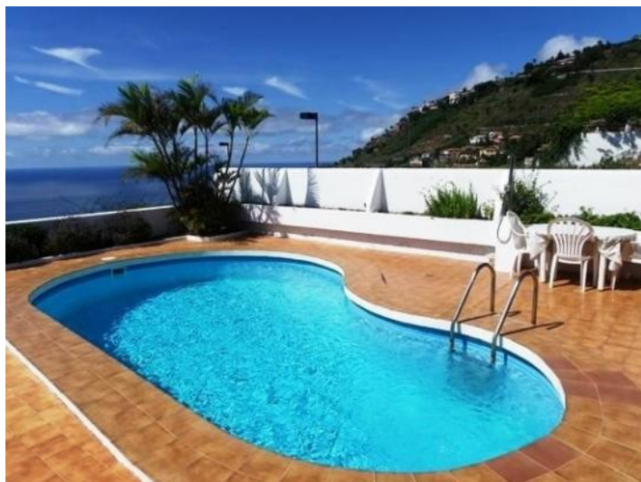
Beautiful panoramic view from the swimming pool to the mountains and sea