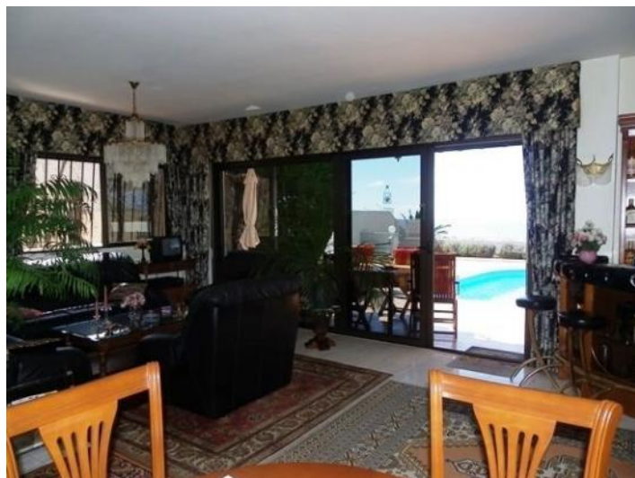
Lots of space and only a few steps into the refreshing pool