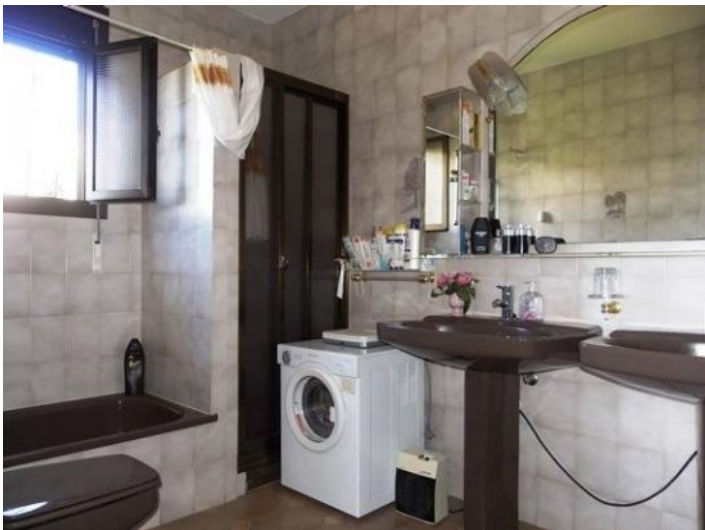
The main bathroom with tub, shower and double sinks