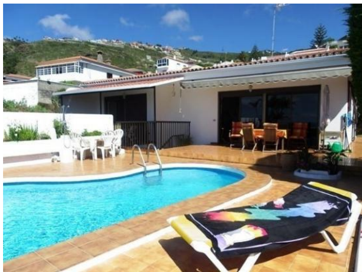
Living room and bedroom with sea view