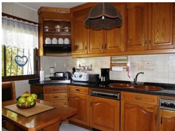
The attractive wood kitchen near the garden