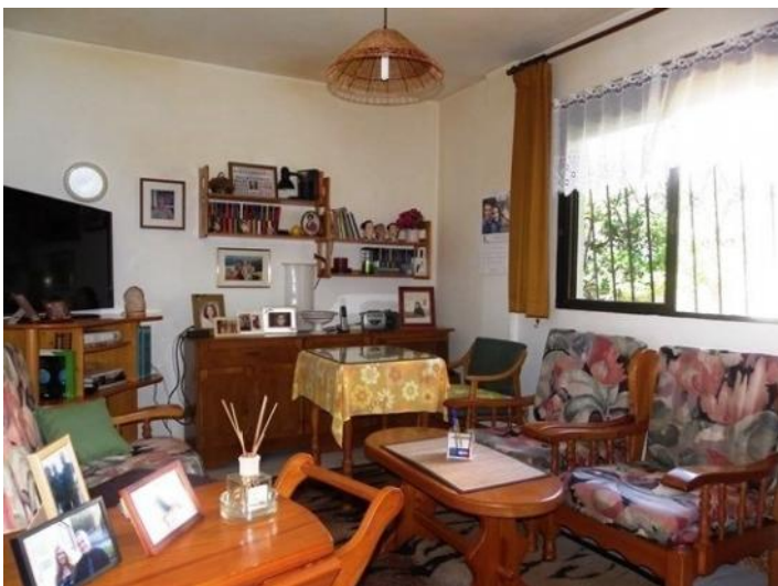
The TV room, or large guest room