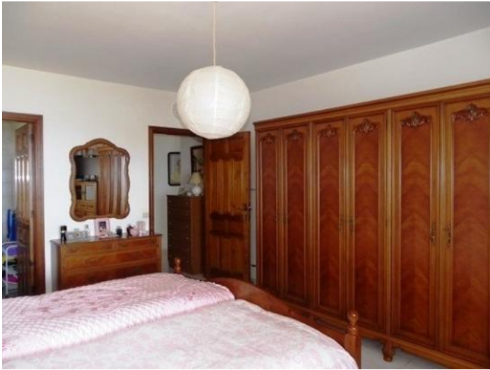
En-suite bathroom and plenty of closet space