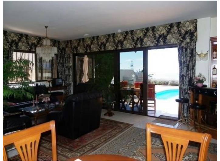
Lots of space and only a few steps into the refreshing pool