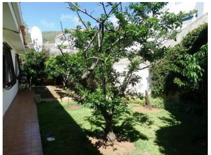
The garden on the back of the house