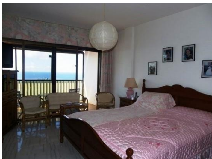
The quiet, large master bedroom with an extra terrace