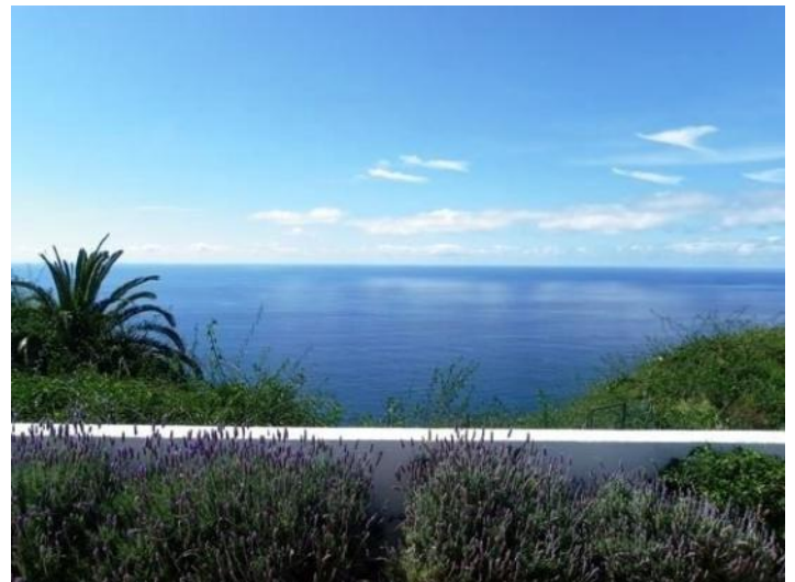
Nature reserve of the cliffs in front of the chalet, with