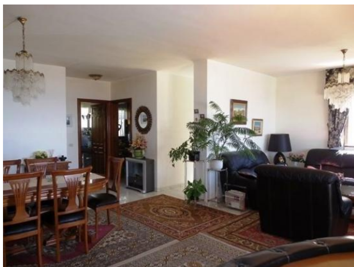
Beautiful room structure with short distances