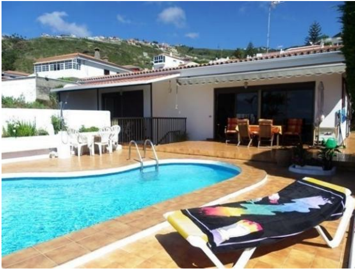
Living room and bedroom with sea view