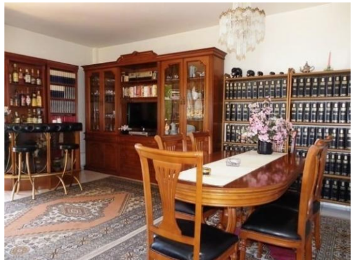
Bar and dining area in the salon