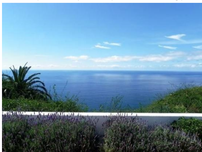
Nature reserve of the cliffs in front of the chalet, with