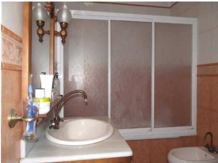
Full equipped bathroom on main bedroom