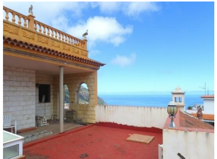
Large terrace with barbecue facilities and on both sides