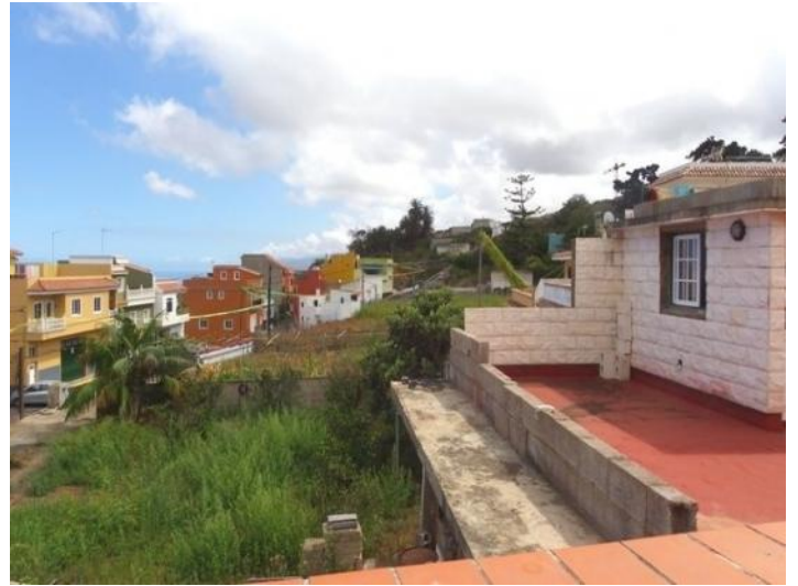
Cultivation over the garage and front garden