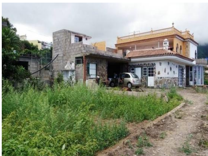
Overall view of the property on a large plot