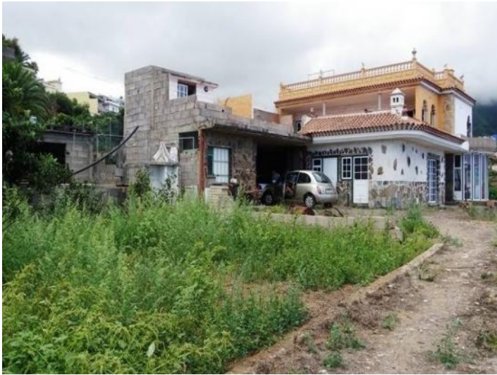
Overall view of the property on a large plot