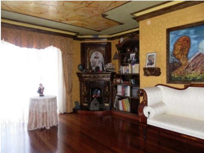
The salon with parquet and warm colors