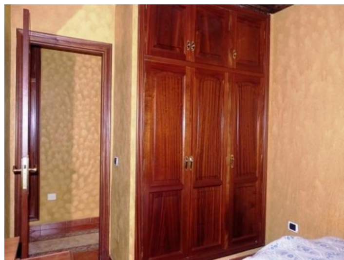
Built-in wardrobe in second bedroom