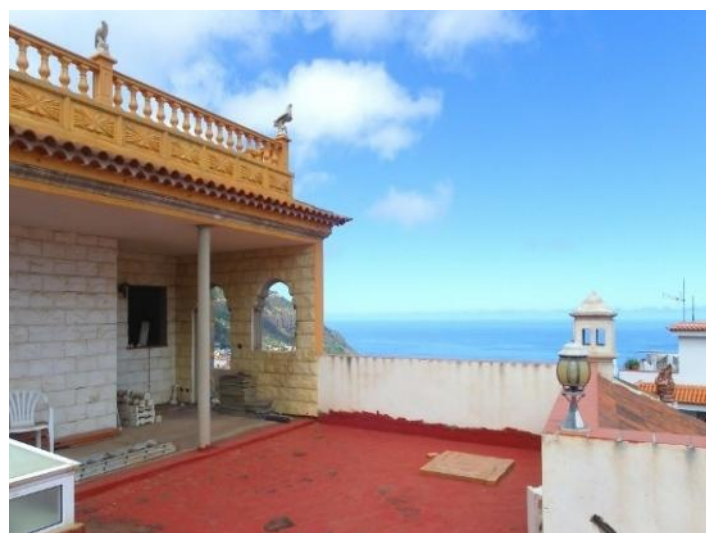
Large terrace with barbecue facilities and on both sides