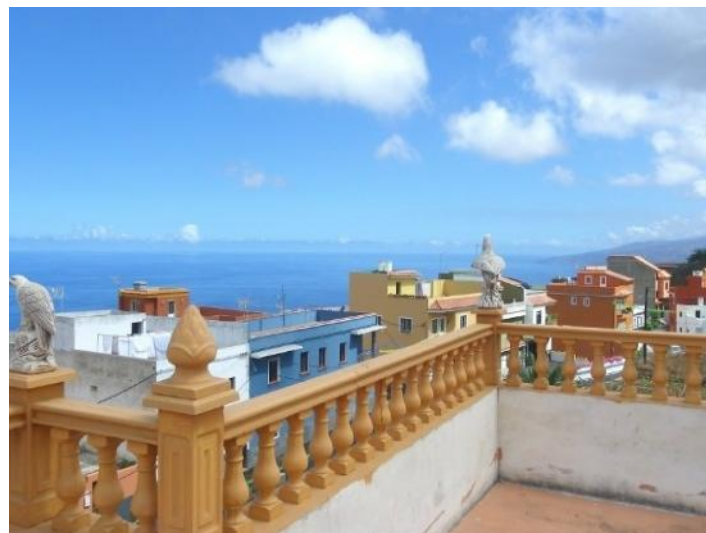
View along the north coast of Tenerife