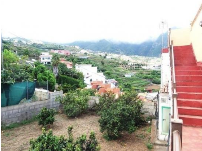
The rear garden