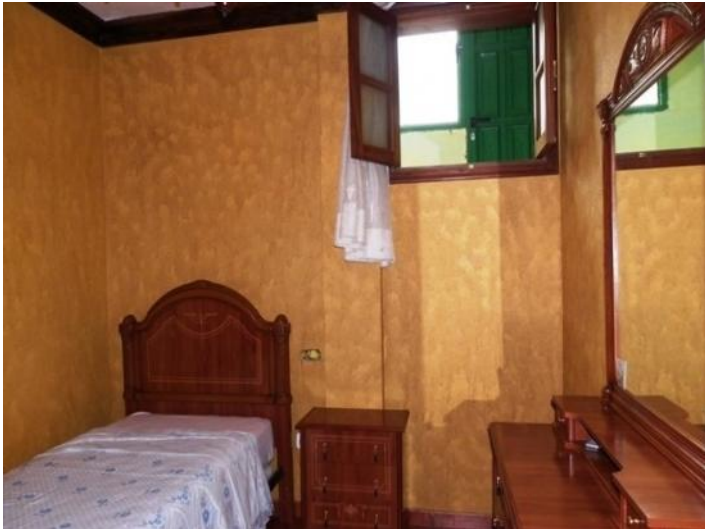
The second bedroom