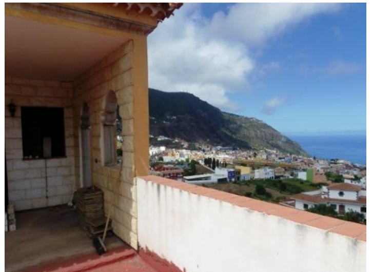
Beautiful views of the valley and the Atlantic