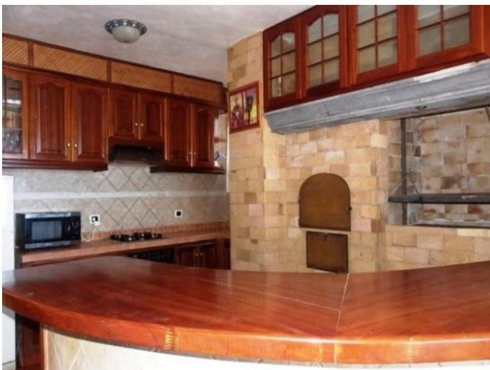
Open kitchen with BBQ