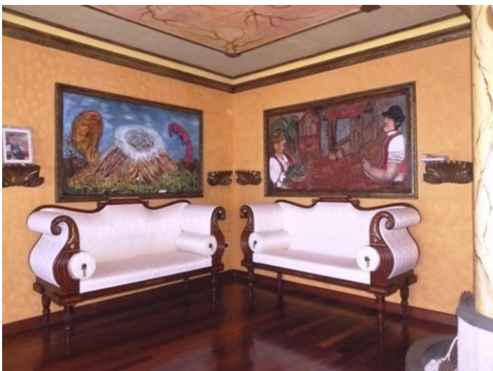
Living room with decorative ceiling design