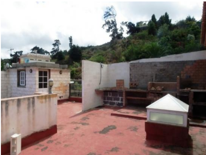
The large terrace for individual design