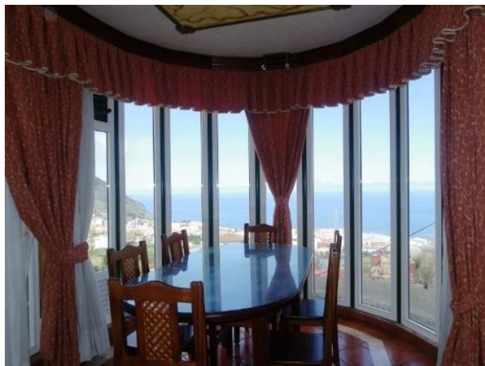
Exquisite views for any occasion