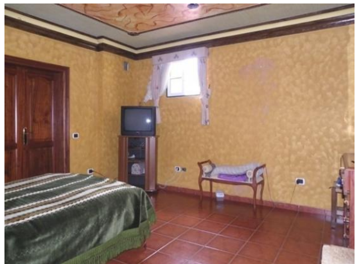
The master bedroom