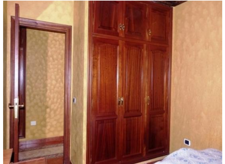
Built-in wardrobe in second bedroom