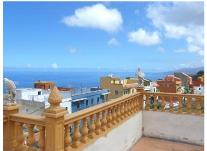
View along the north coast of Tenerife