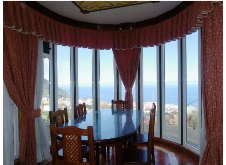
Exquisite views for any occasion