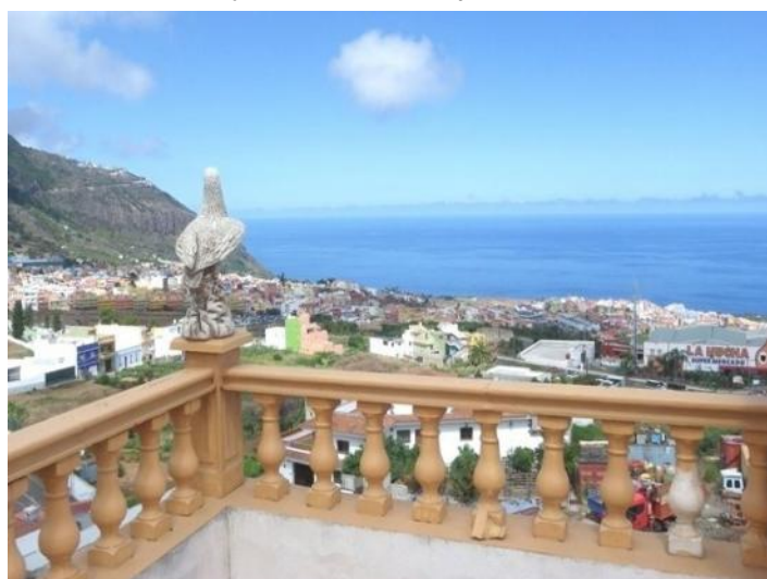
Panoramic sea views from the roof terrace