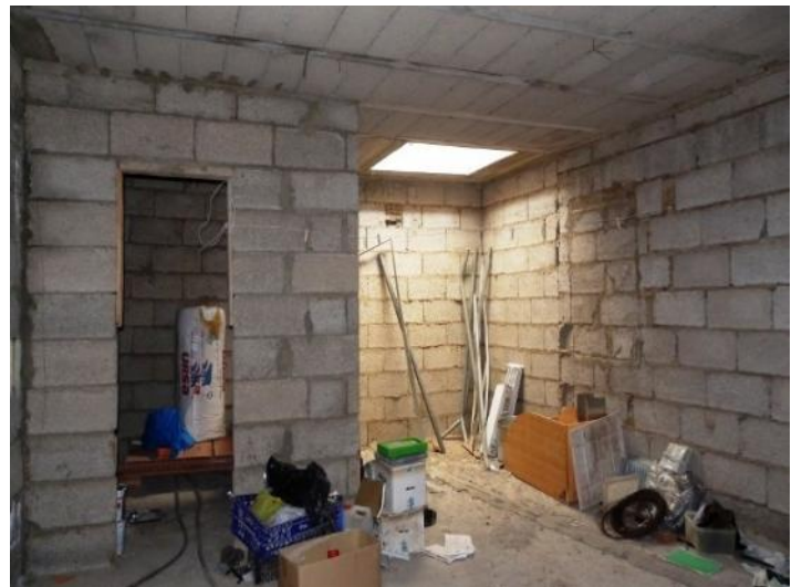
Probable bedroom and bathroom