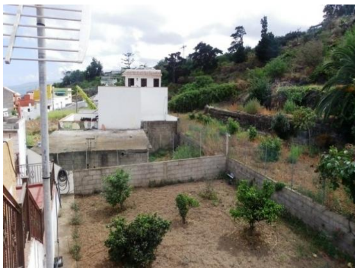
Free landscape view behind the villa