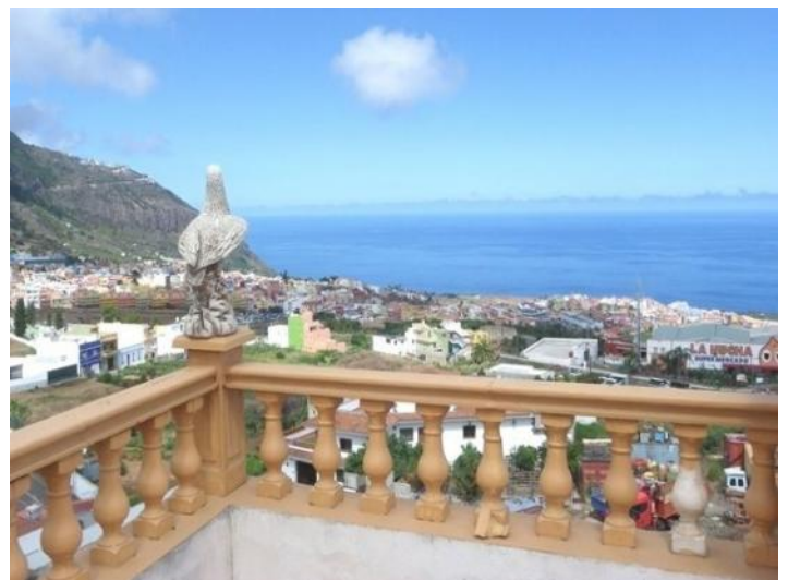
Panoramic sea views from the roof terrace