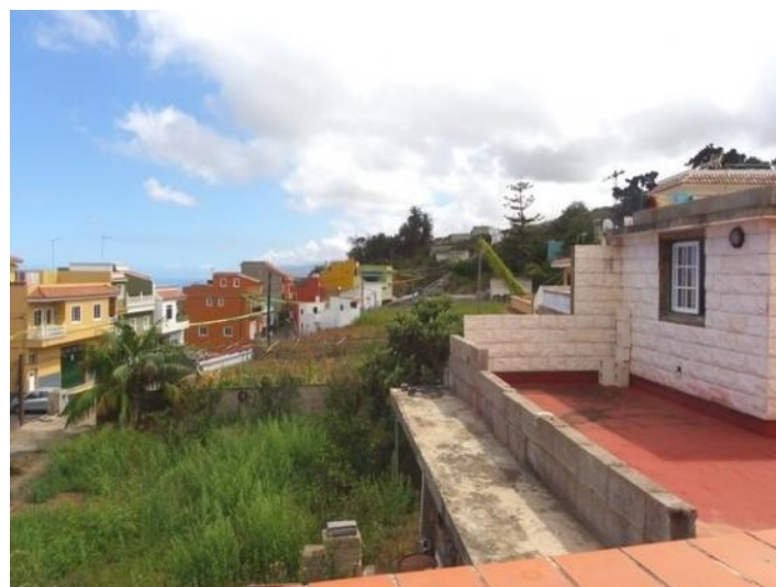
Cultivation over the garage and front garden