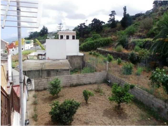
Free landscape view behind the villa