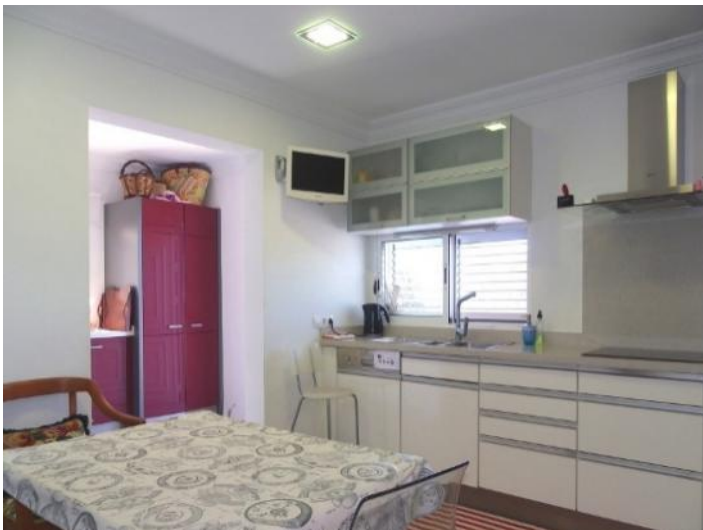
Spacious fully equipped kitchen with laundry