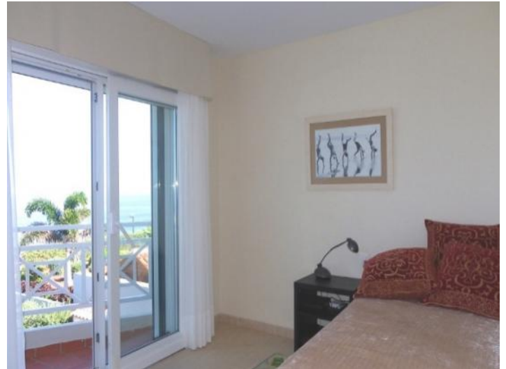
Bright bedroom with modern glass doors and ocean view