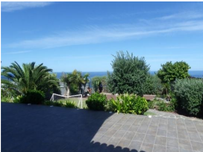
Oasis with large terrace, garden and the sea