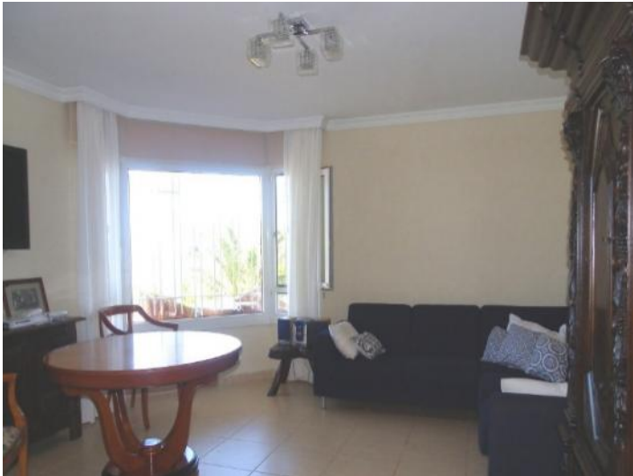
Cozy living room of the house