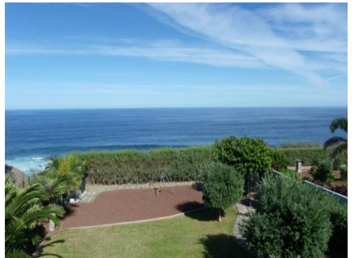
Amazing view of the garden and the sea