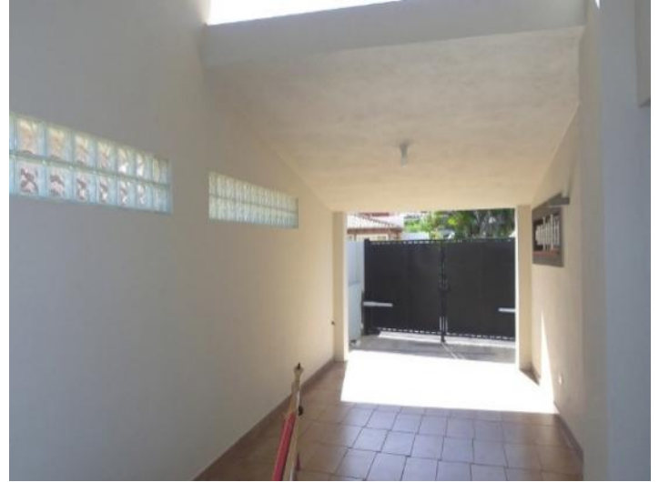
Large carport beside the garage