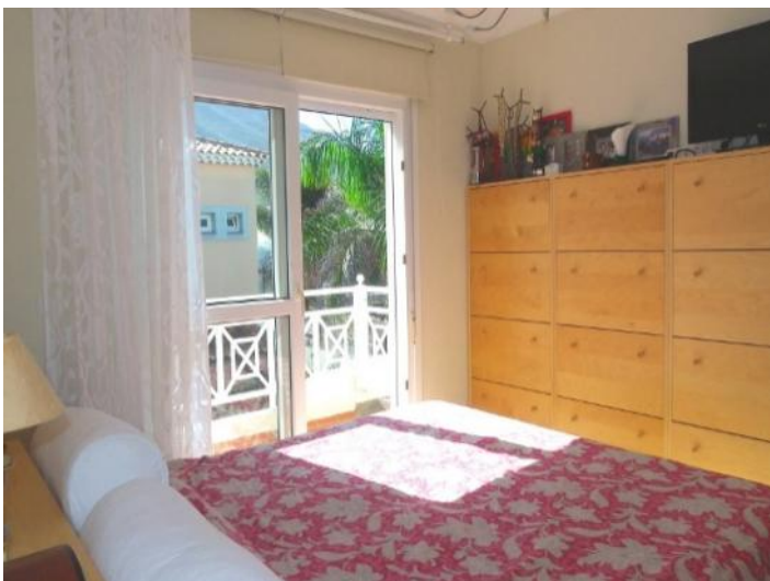
Another large bedroom with balcony