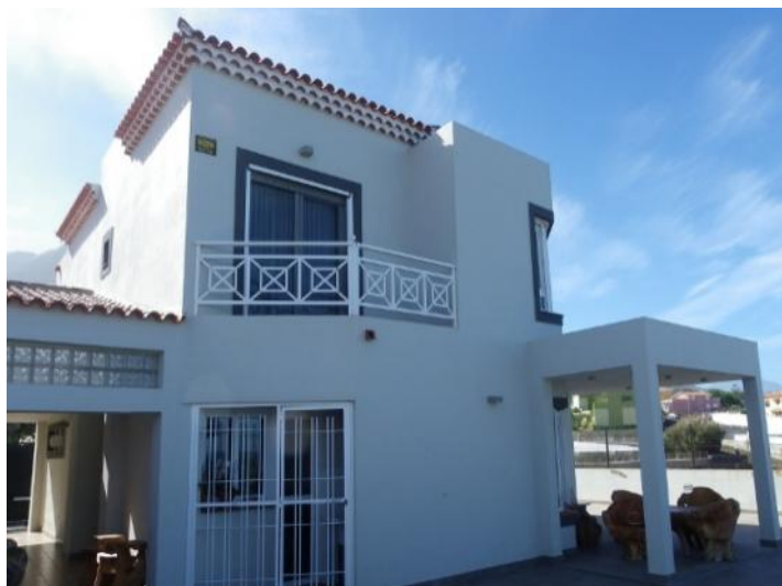
Exterior view of the modern villa