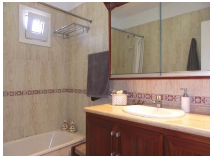
Nice bathroom with bath tub