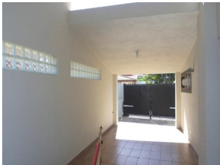
Large carport beside the garage