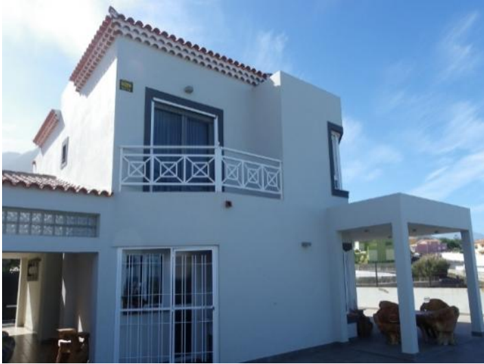
Exterior view of the modern villa