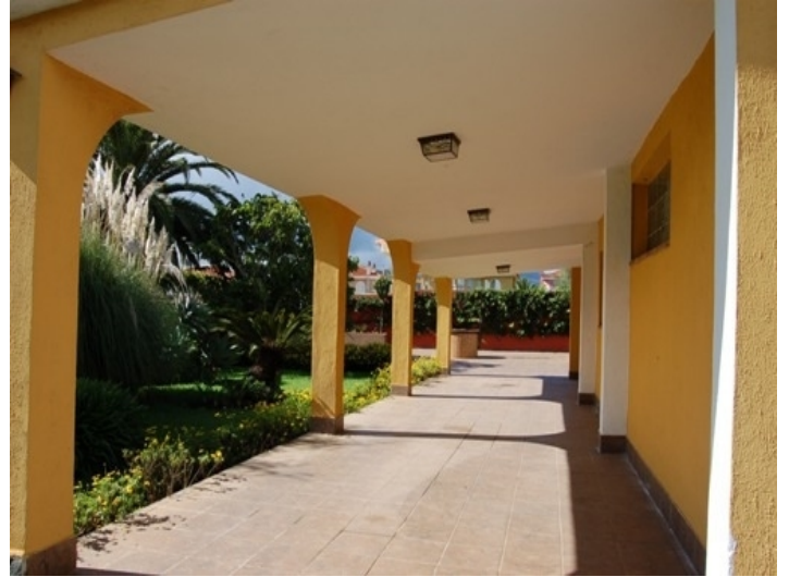
Porch alongside the garden