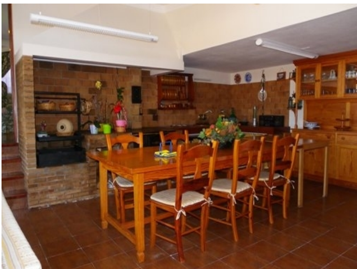
The fireplace in the living room