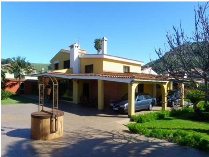
House in a long shot with own fountain