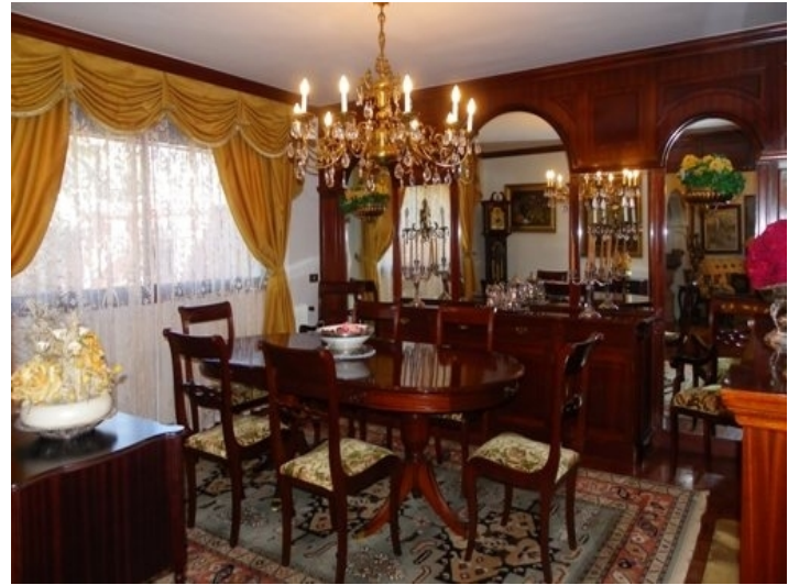
Dining Room of mahogany