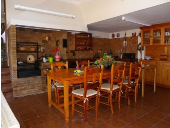
Large kitchen with barbecue