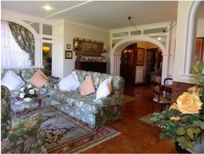
The large living room at the garden