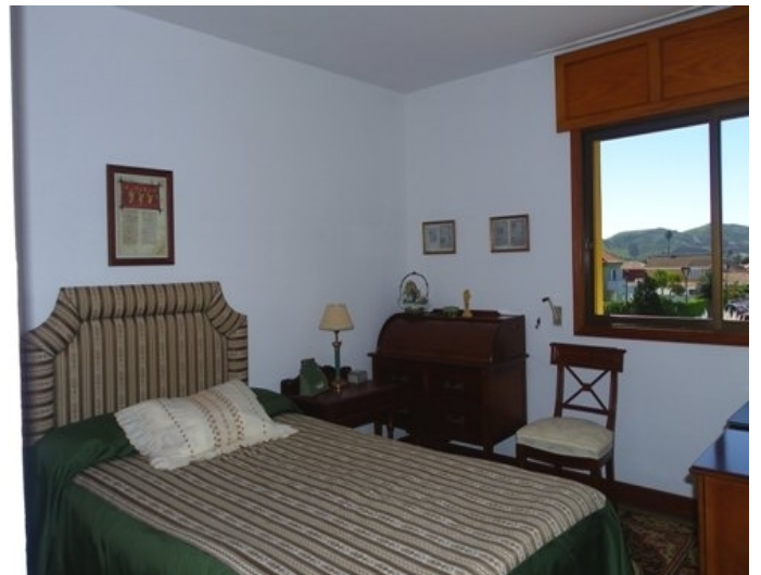
Bedroom with beautiful view