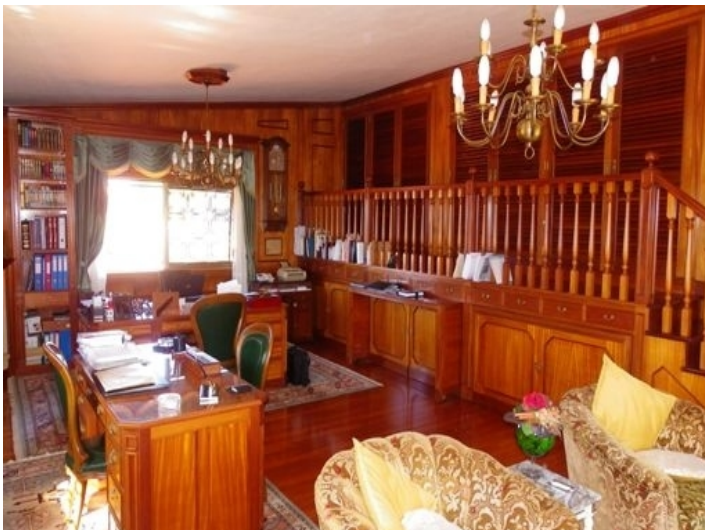
Large multipurpose room with hardwood and lots of storage