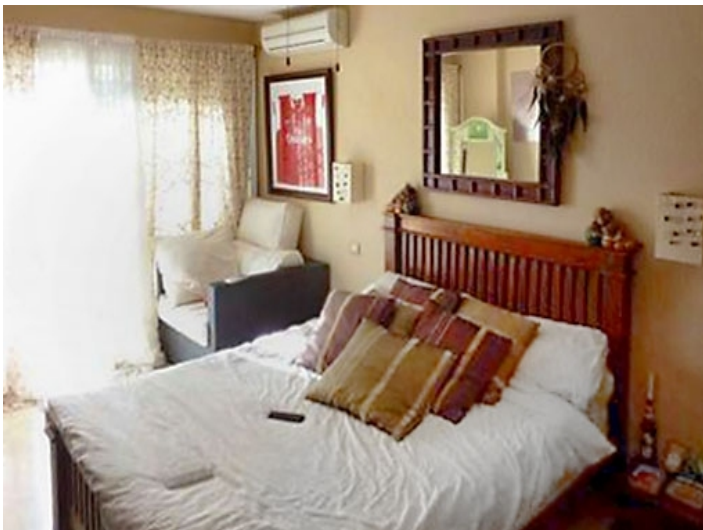
Comfortable double bedroom with large windows