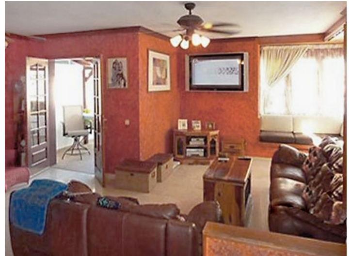
Large open living room with balcony