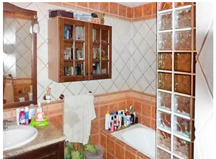
Bathroom in Spanish style