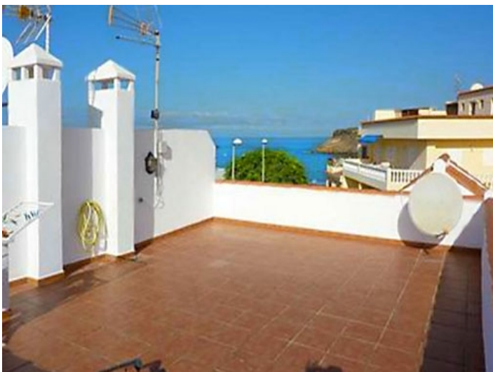
Rooftop deck with all around view