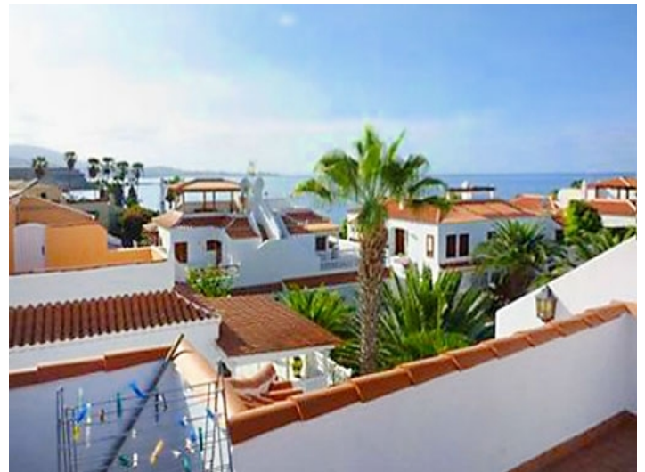
View on the mountains, the village and the sea