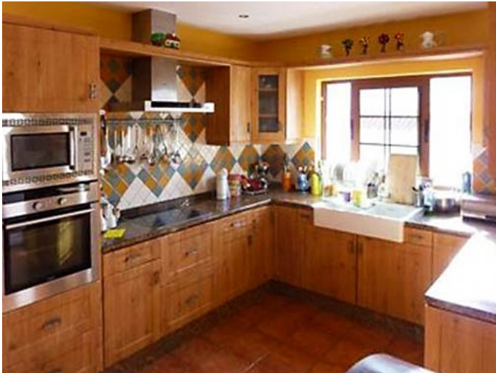
Rustic kitchen with wood panelling and granite worktops