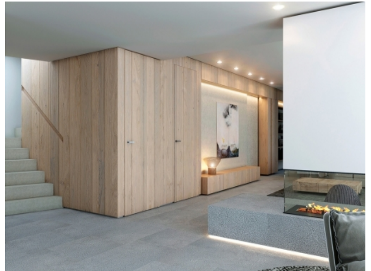
Delightful living area with fireplace