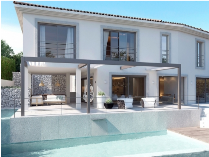
Amazing exterior design with chill out area and infinity pool