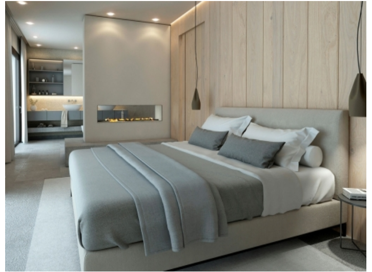
Light and cosy bedroom