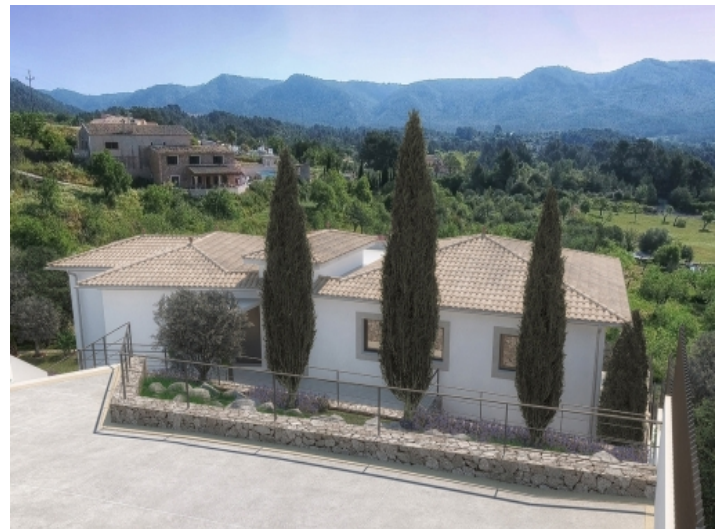
Unique landscape views from the balcony