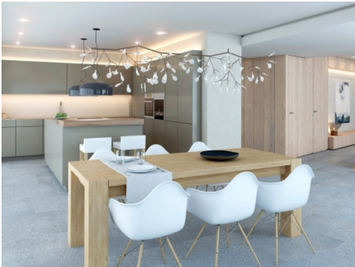
Modern kitchen and dining area