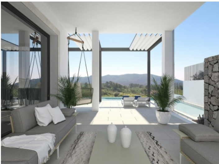
Lounge area on the covered terrace