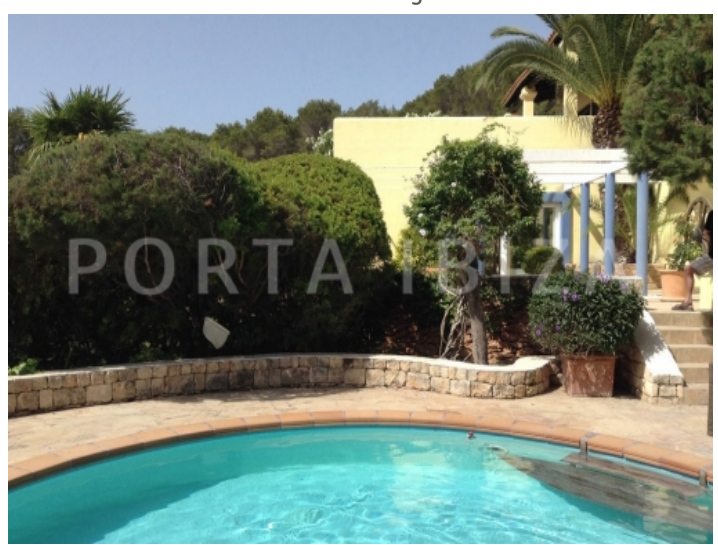
san carlos-villa-pool area