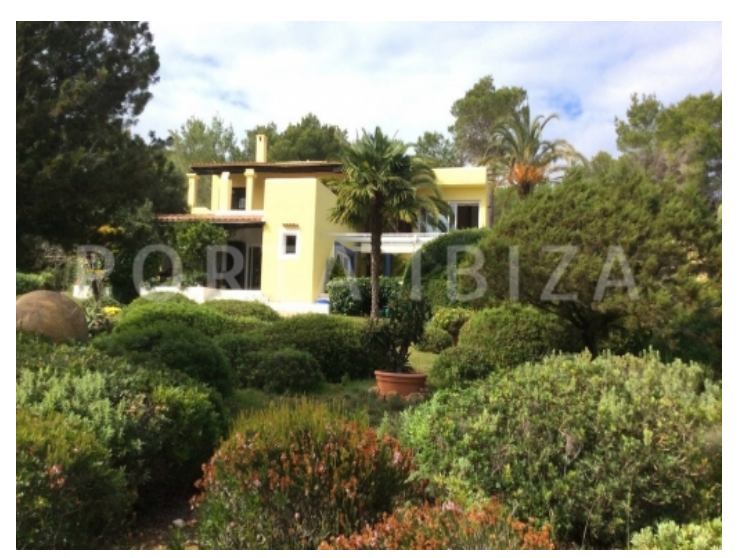
san carlo-villa-outdoor area