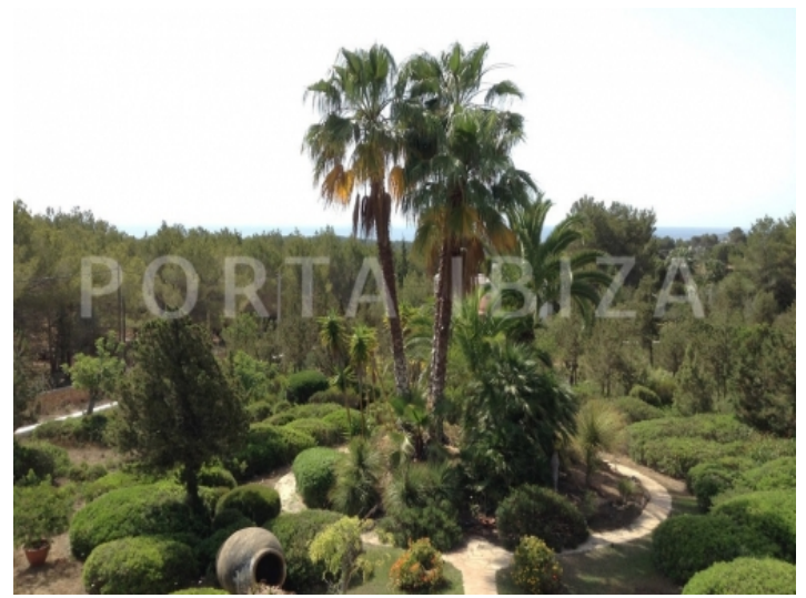
view garden-villa-san carlos