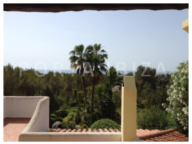
sea view-san carlos-villa