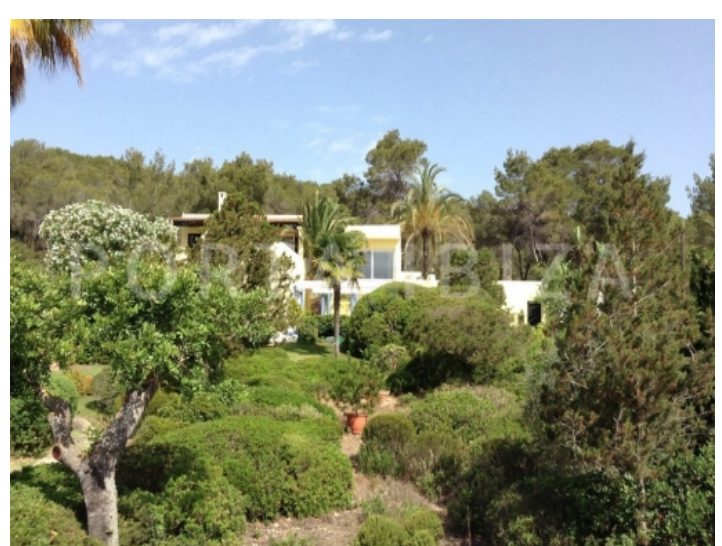
san carlos-villa- garden