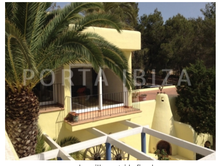
san carlos-villa- outside fireplace