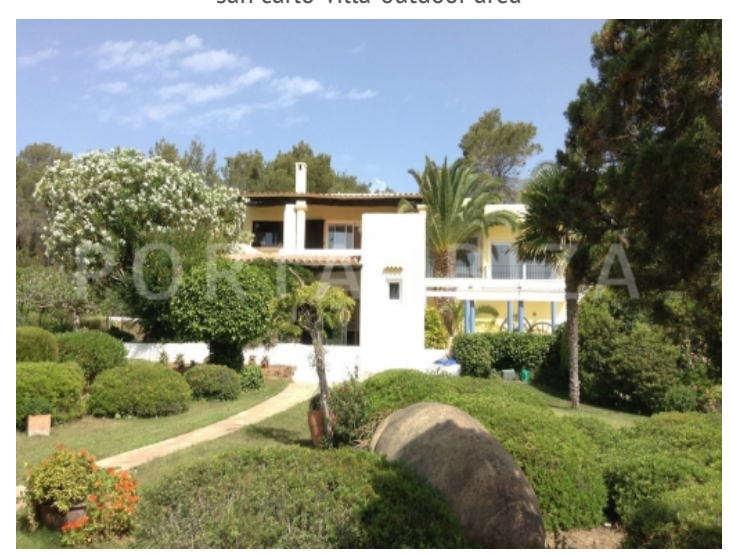
san carlos-villa- front view