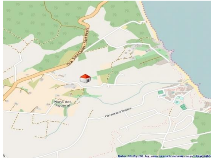
villa san carlos