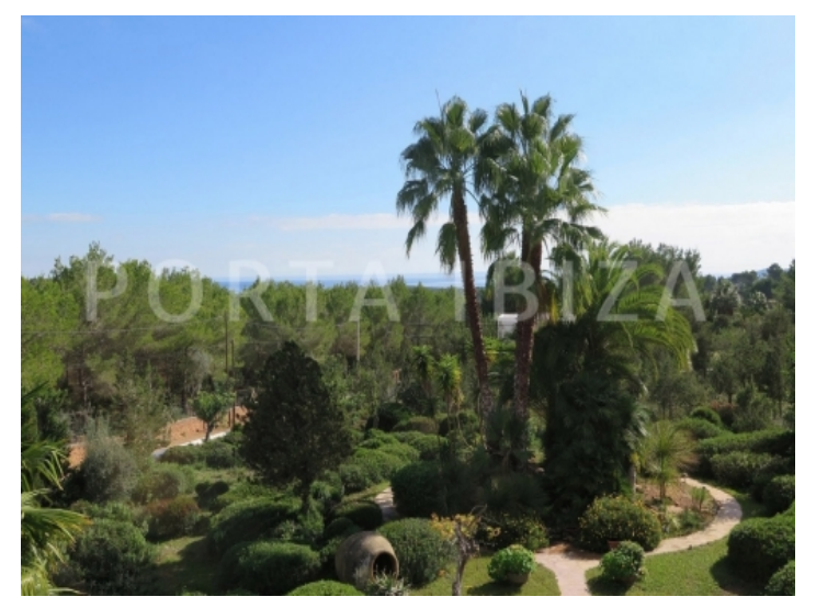
sea view-villa-san carlos