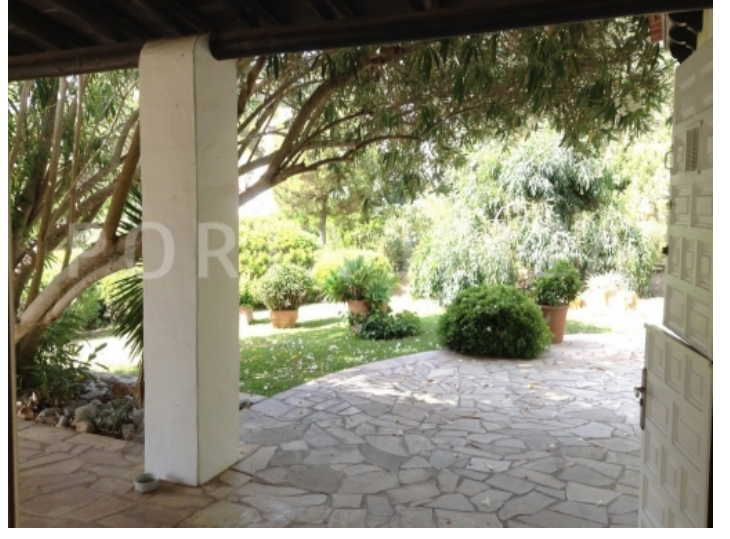
view garden-san carlos-villa