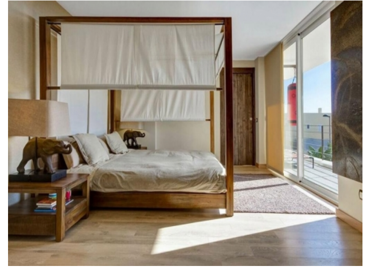
bedroom-fantastic modern villa-ibiza-talamanca