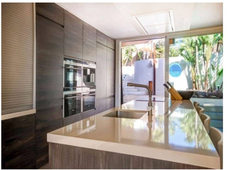
kitchen & dinner-fantastic modern villa-ibiza-talamanca