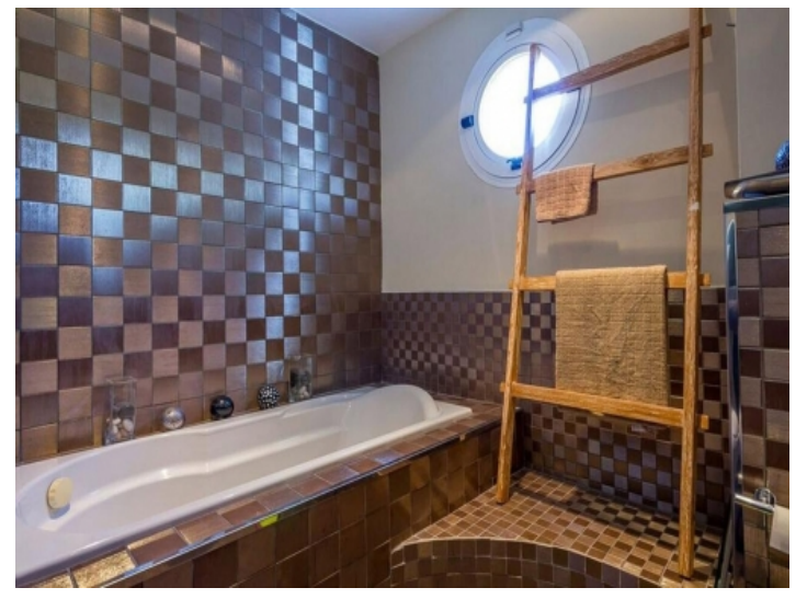
bath-fantastic modern villa-ibiza-talamanca