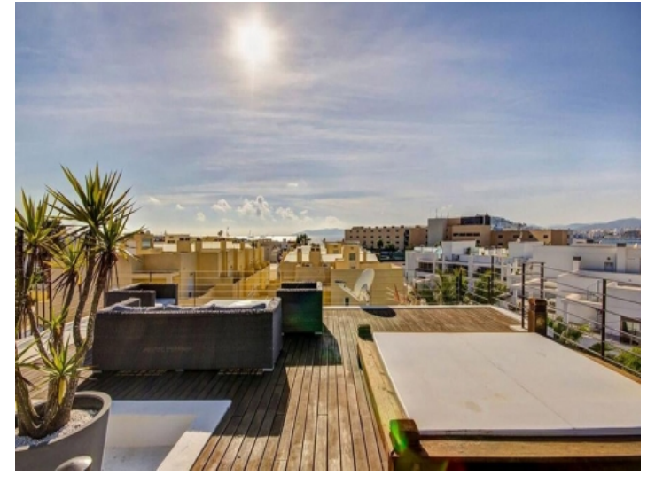
roofterrace-fantastic modern villa-ibiza-talamanca