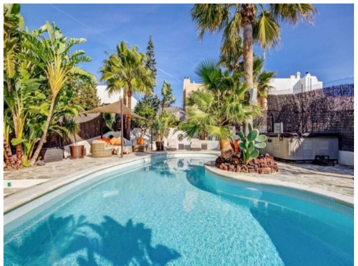
pool area-fantastic modern villa-ibiza-talamanca