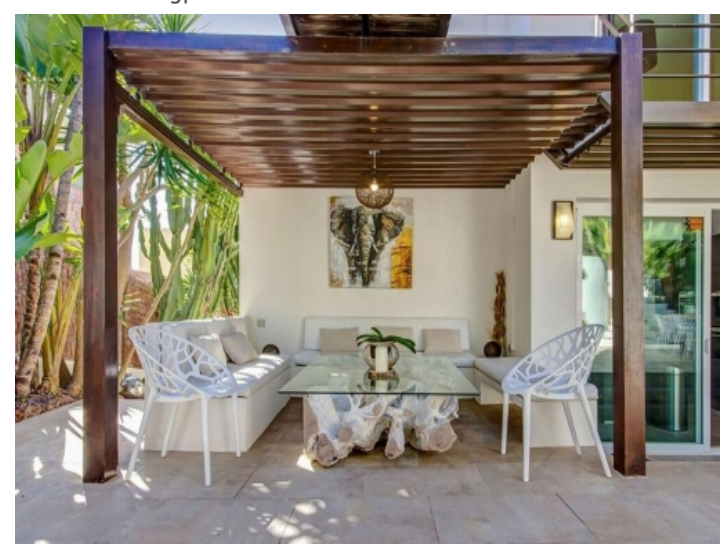
chillout-fantastic modern villa-ibiza-talamanca

swimmingpool-fantastic modern villa-ibiza-talamanca