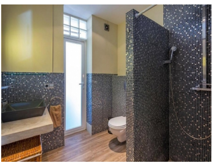
bathroom2-fantastic modern villa-ibiza-talamanca