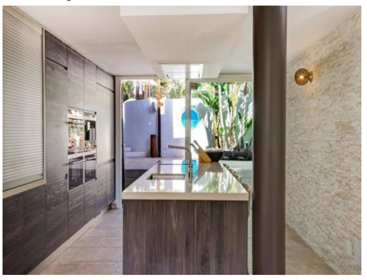
kitchen-fantastic modern villa-ibiza-talamanca