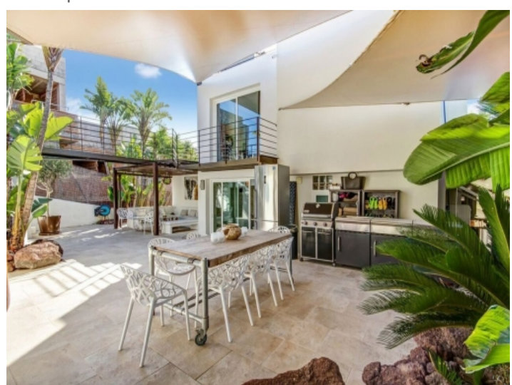
BBQ-fantastic modern villa-ibiza-talamanca

PORTA IBIZA, MINIMAL HOUSE & ART S.L. • , D-80539 IBIZA, SPAIN TEL.: +34 971 194 135 • INFO@PORTAIBIZA.COM • WWW.PORTAIBIZA.COM