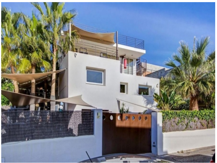
entrance-fantastic modern villa-ibiza-talamanca