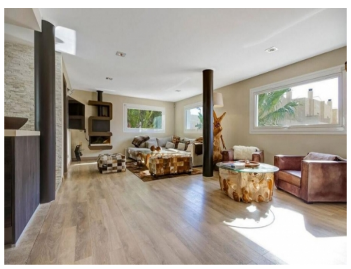
livingroom-fantastic modern villa-ibiza-talamanca