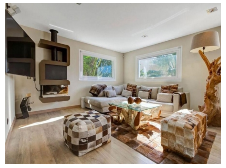
chill & living-fantastic modern villa-ibiza-talamanca