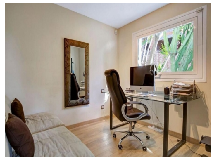
office-fantastic modern villa-ibiza-talamanca

PORTA IBIZA, MINIMAL HOUSE & ART S.L. • , D-80539 IBIZA, SPAIN TEL.: +34 971 194 135 • INFO@PORTAIBIZA.COM • WWW.PORTAIBIZA.COM