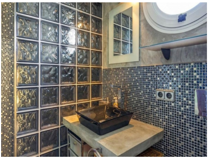
bathroom-fantastic modern villa-ibiza-talamanca