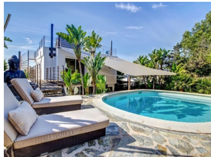
pool & sundeck-fantastic modern villa-ibiza-talamanca