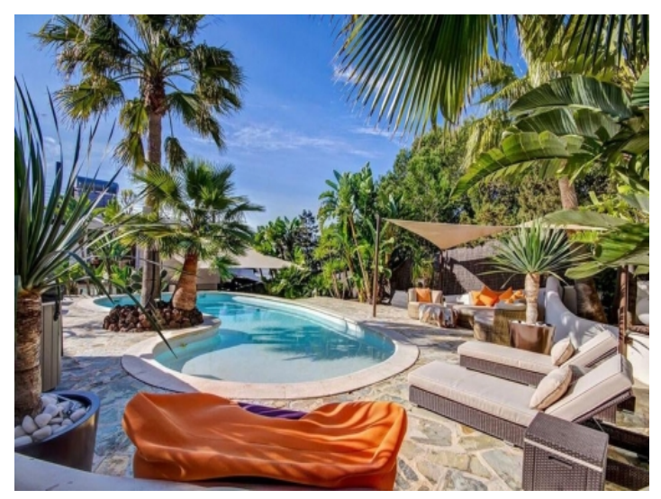
pool-fantastic modern villa-ibiza-talamanca