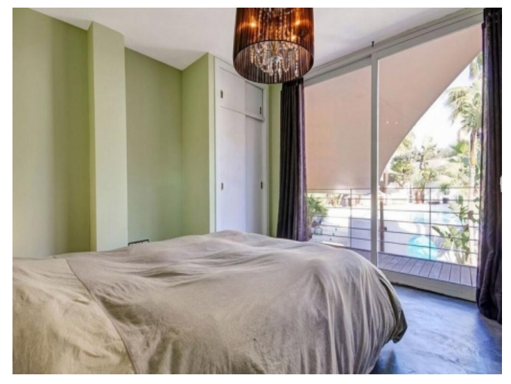
bedroom3-fantastic modern villa-ibiza-talamanca