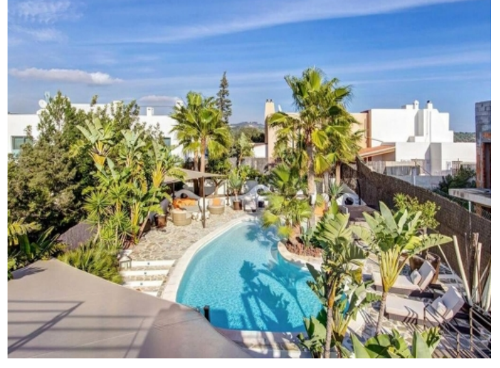
pool & garden-fantastic modern villa-ibiza-talamanca