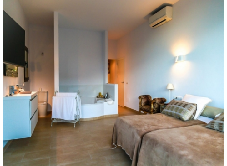
FIRST LINE-VILLA-CALA MOLÍ-BEDROOM3