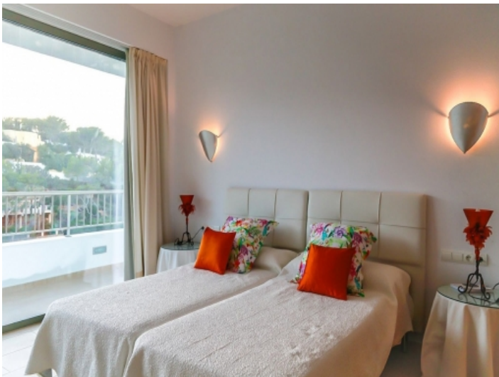
FIRST LINE-VILLA-CALA MOLÍ-BEDROOM1