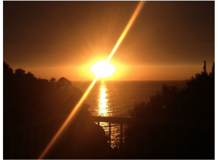
FIRST LINE-VILLA-CALA MOLÍ-SUNSET