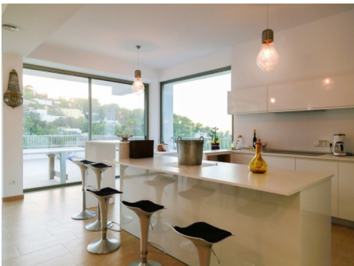
FIRST LINE-VILLA-CALA MOLÍ-KITCHEN