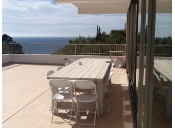
FIRST LINE-VILLA-CALA MOLÍ-OUTDOOR DINNER