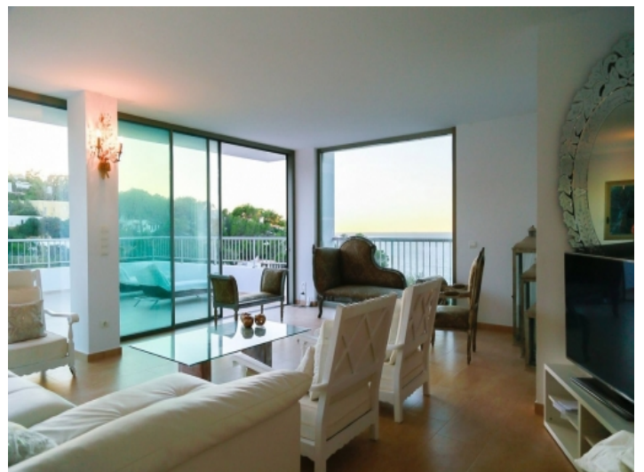
FIRST LINE-VILLA-CALA MOLÍ-LIVINGROOM