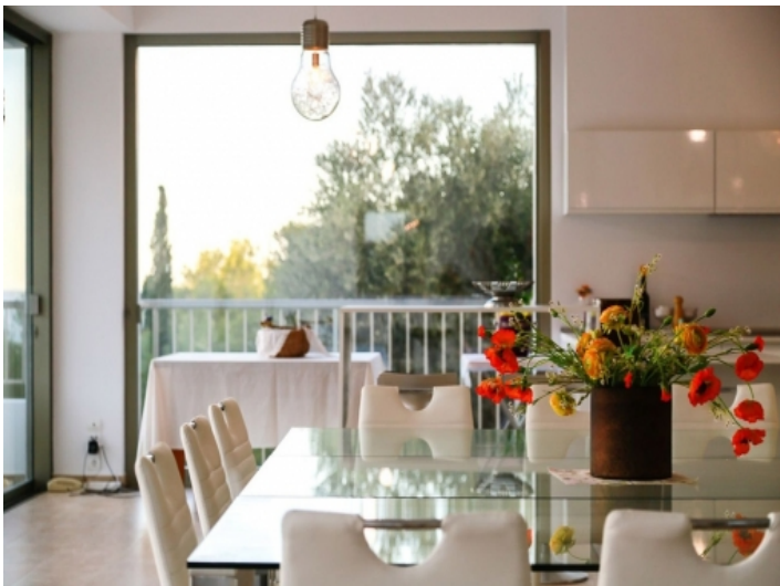
FIRST LINE-VILLA-CALA MOLÍ-DINNER