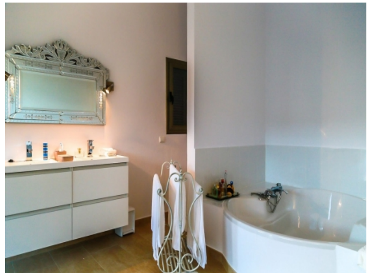
FIRST LINE-VILLA-CALA MOLÍ-BATHROOM