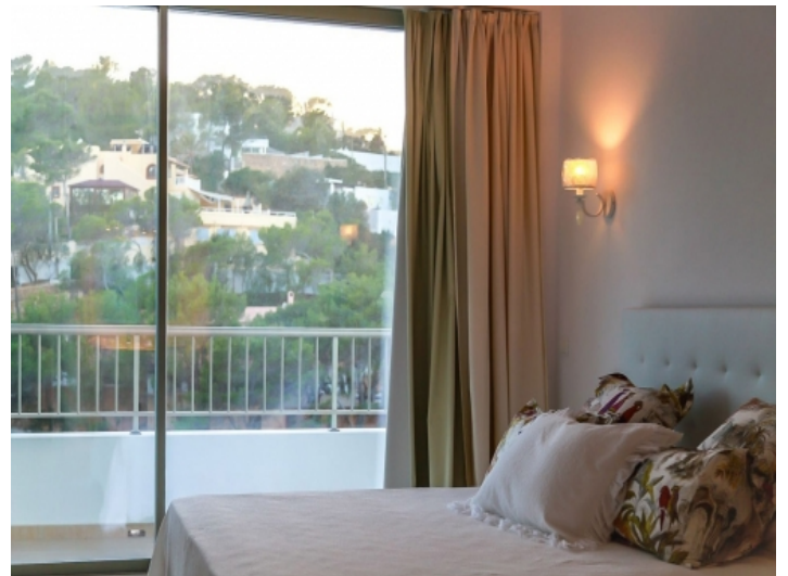
FIRST LINE-VILLA-CALA MOLÍ-BEDROOM2