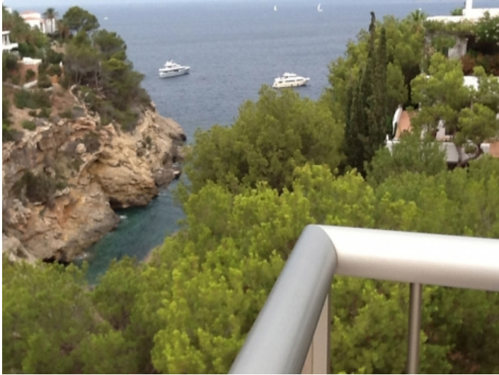
FIRST LINE SEAVIEW-VILLA-CALA MOLÍ-BEDROOM2