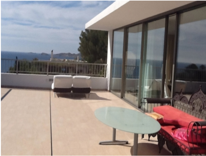
FIRST LINE-VILLA-CALA MOLÍ-TERRACE