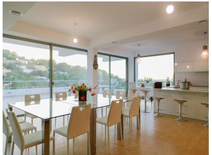
FIRST LINE-VILLA-CALA MOLÍ-KITCHEN & DINNER