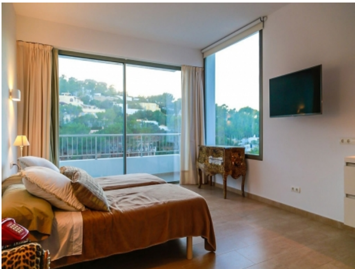
BEDROOM3-FIRST LINE-VILLA-CALA MOLÍ