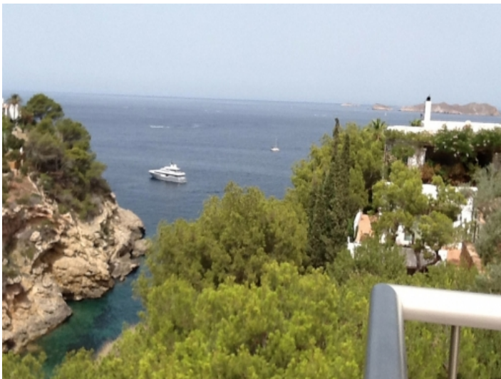
FIRST LINE TERRACE-VILLA-CALA MOLÍ