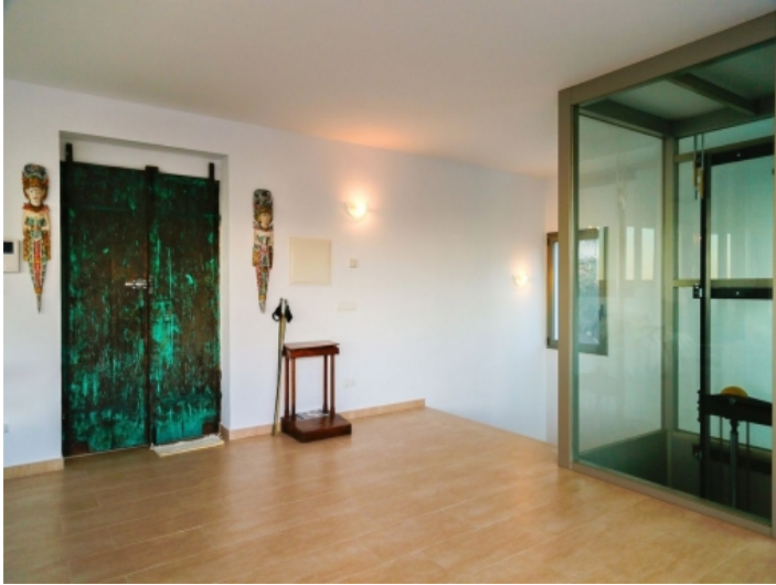
FIRST LINE-VILLA-CALA MOLÍ-LIVING