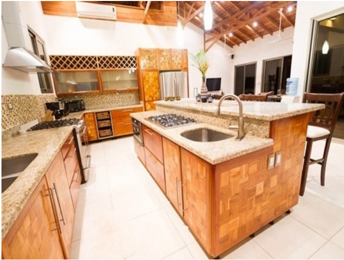
Large, well equipped kitchen