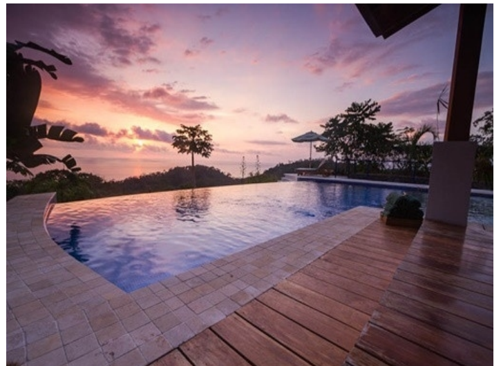
large infinity pool