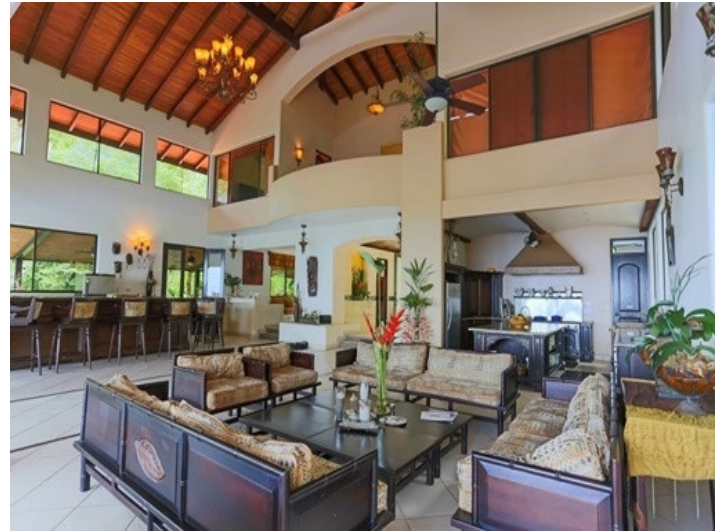
cozy lounge area