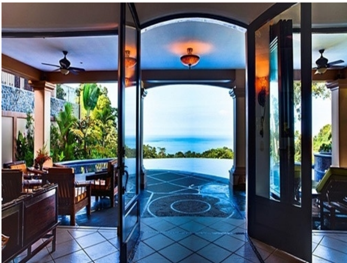
stunning view from the livingroom and terrace