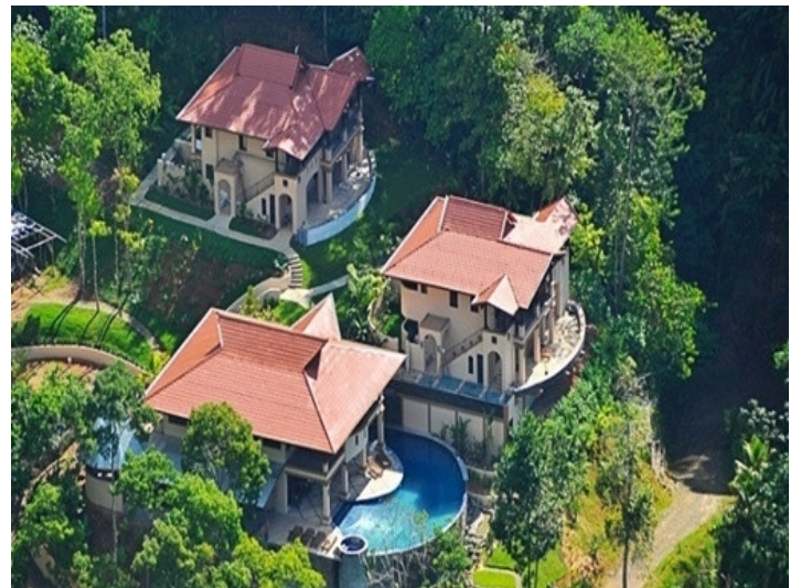
Main villa with two guesthouses