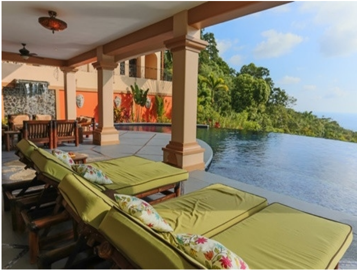
Infinity Pool and panoramic View