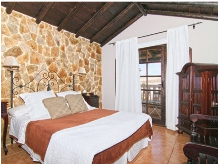
Bedroom with natural stone wall and wooden beams