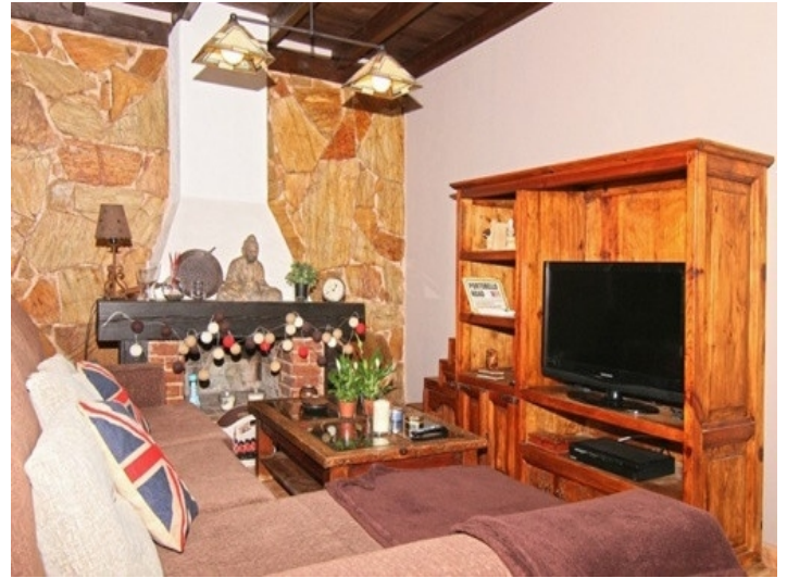
Cosy living room with chimney