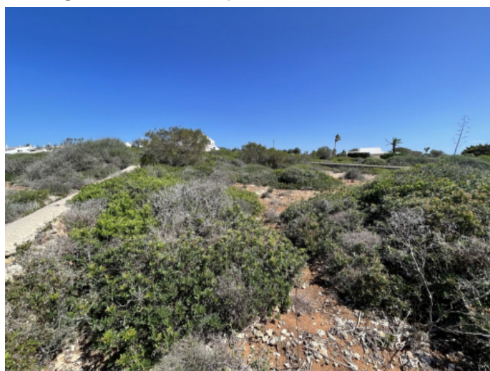
Magnificent investment plot, first line of sea, sea view,