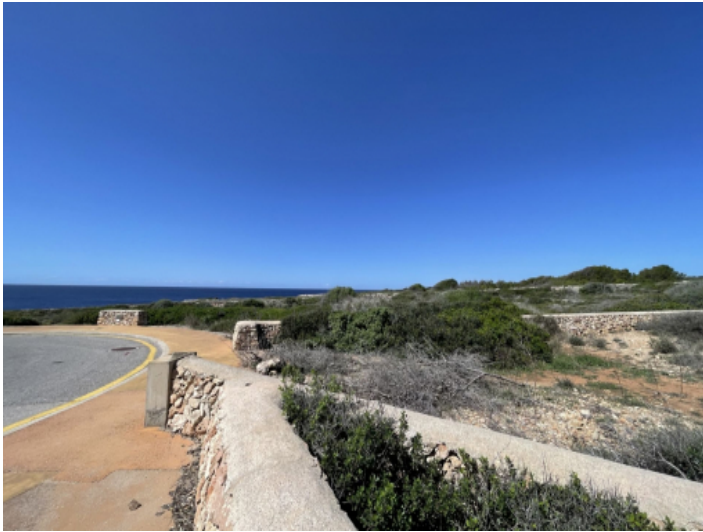
Magnificent investment plot, first line of sea, sea view, located in Binidali, Menorca.