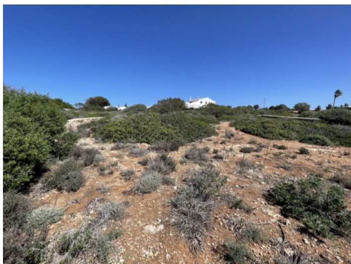
Magnificent investment plot, first line of sea, sea view,