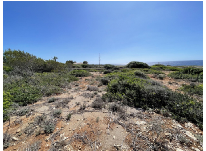
Magnificent investment plot, first line of sea, sea view, located in Binidali, Menorca.