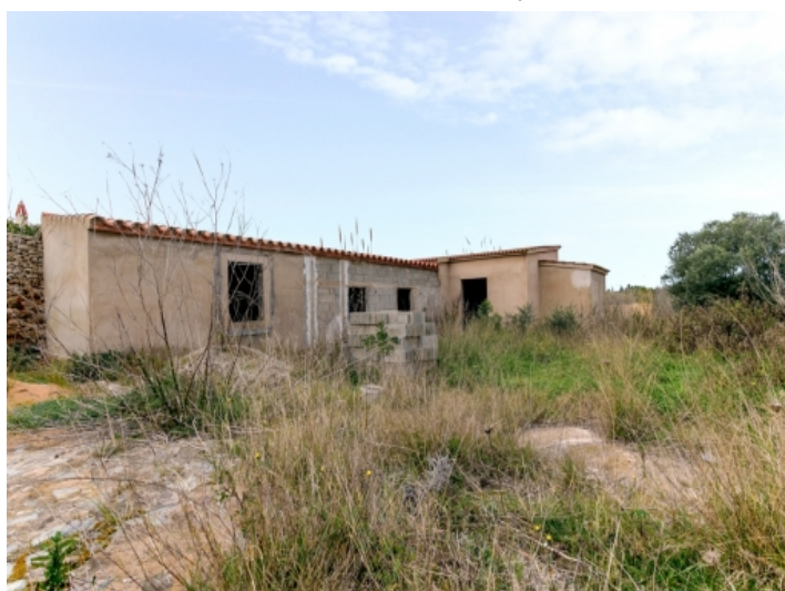
Alternative view of the plot