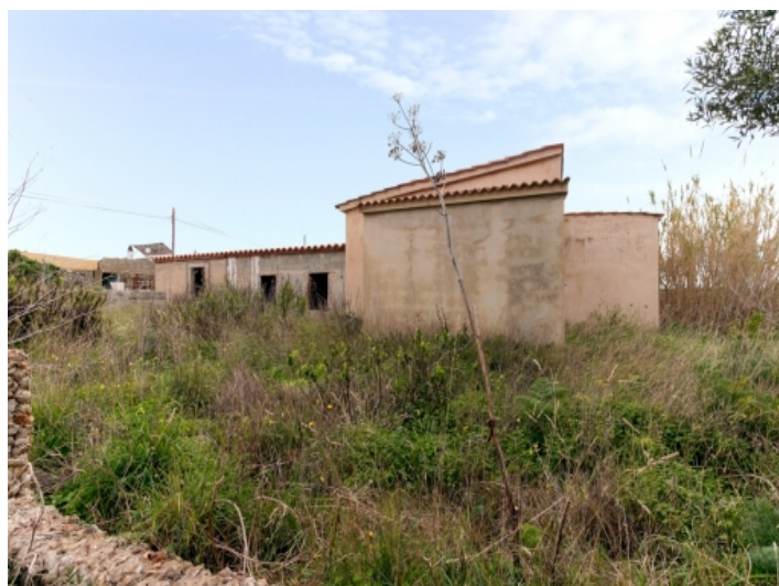
Alternative view of the plot