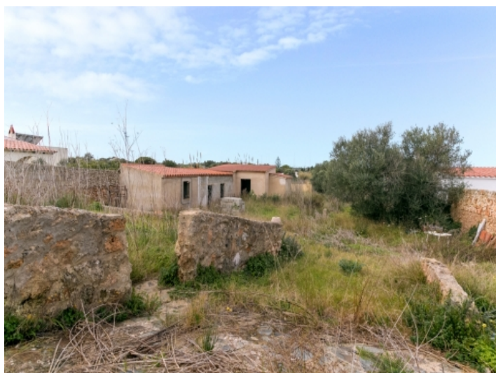
Alternative view of the plot