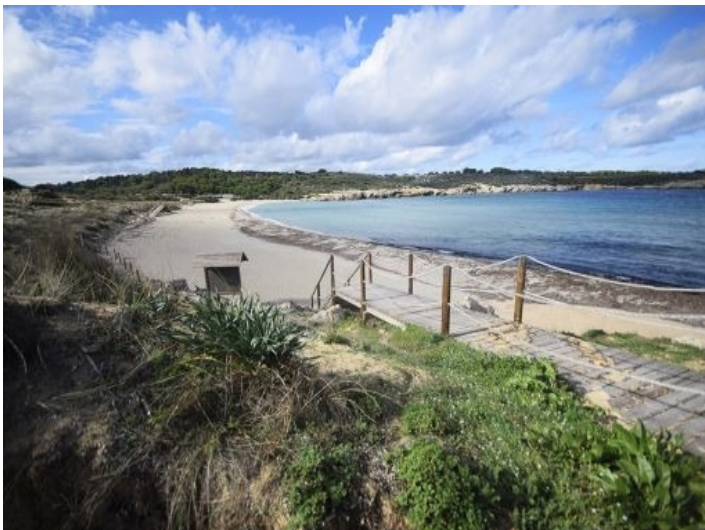
Idyllic sea views