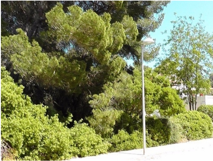
Plot of land