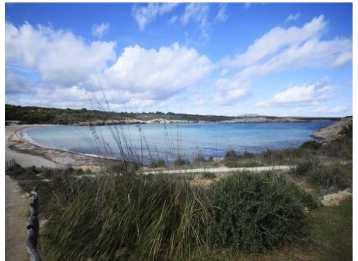
Views to the mediterranean sea