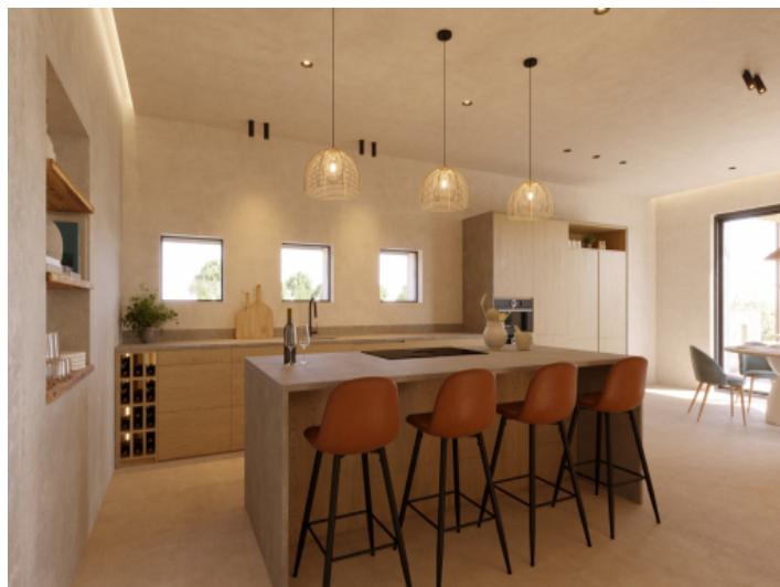
Visualications Inside and outside