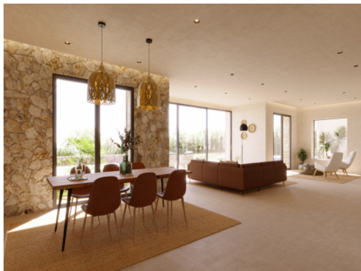
Visualications Inside and outside