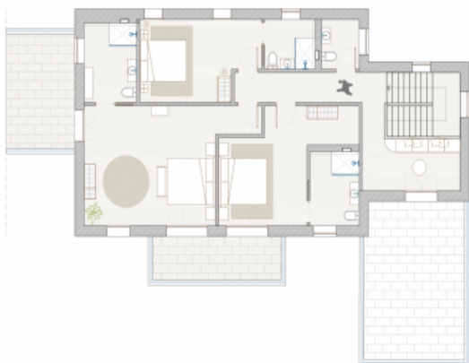
FIRST FLOOR PLAN 1:175