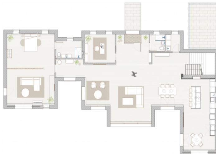
GROUND FLOOR PLAN 1:175