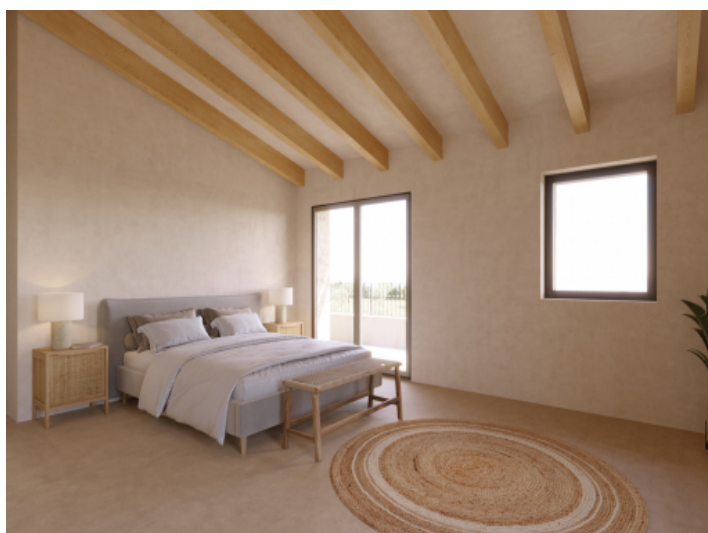
Visualications Inside and outside