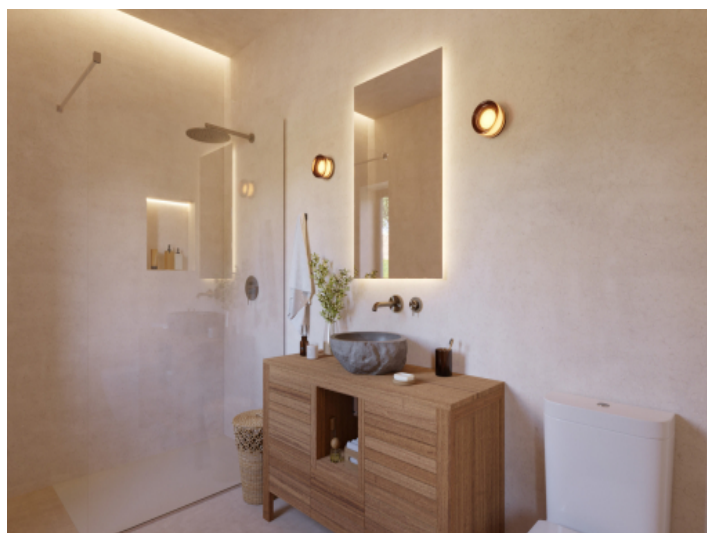
Visualications Inside and outside