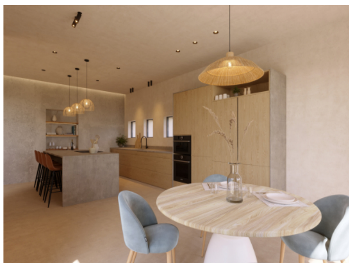
Visualications Inside and outside