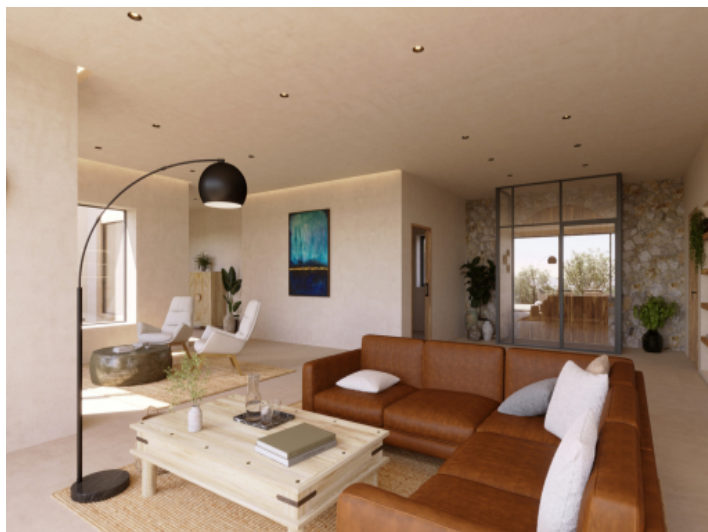
Visualications Inside and outside