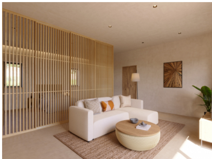
Visualications Inside and outside