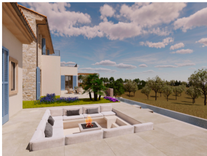
Visualications Inside and outside