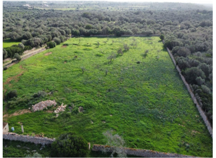
Plot with seaview