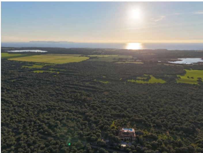
Views to Cabrera