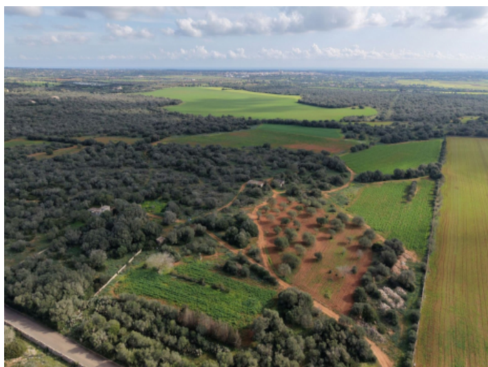
Building plot near Santanyi