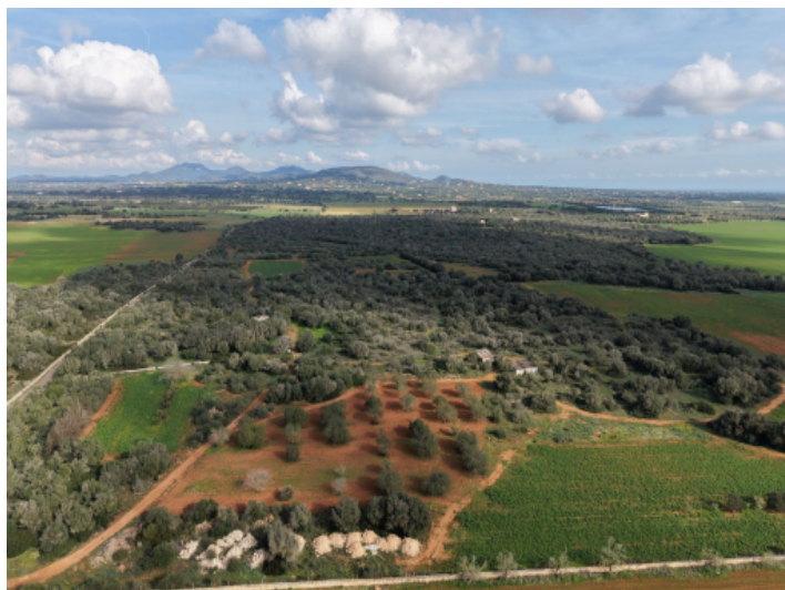
Building plot near Santanyi