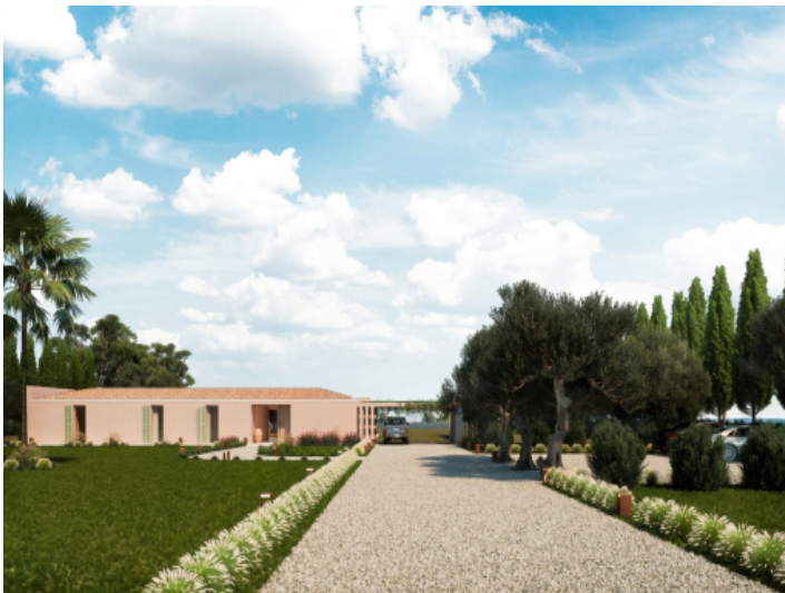
Driveway to the property