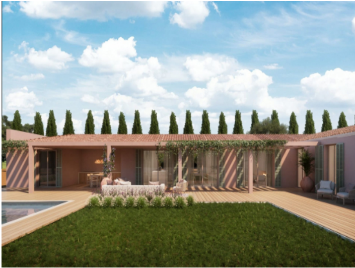
View to the property