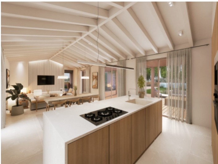
Living, dining and kitchen area