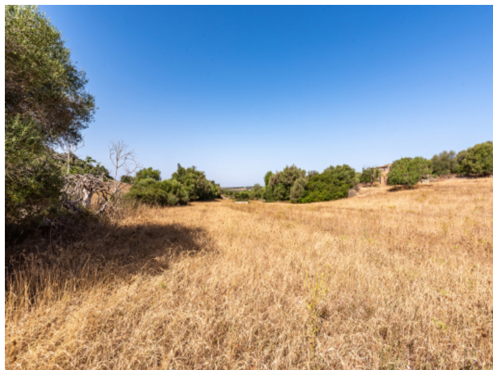
Amazing plot with building license