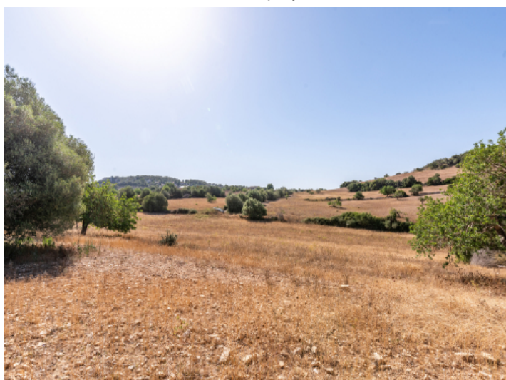
Amazing plot with building license