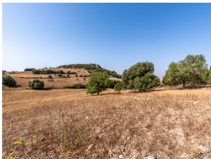
Amazing plot with building license