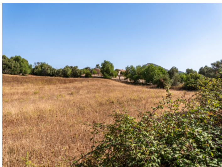
Amazing plot with building license