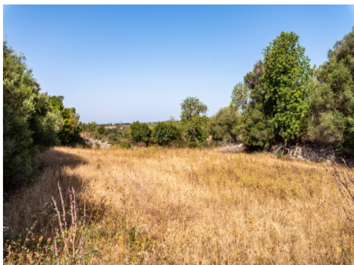
Amazing plot with building license