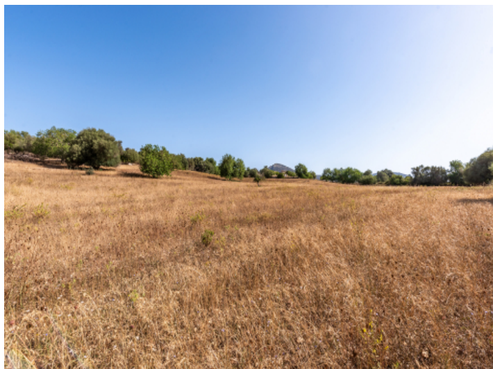
Amazing plot with building license