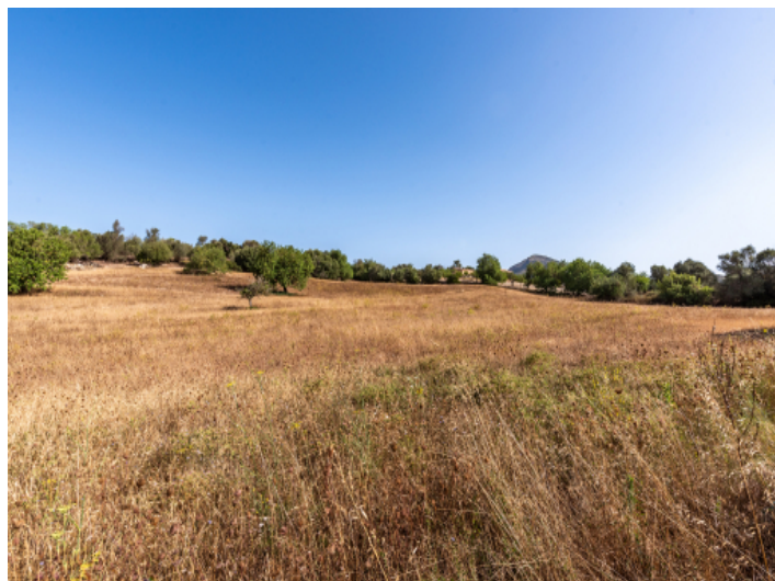
Amazing plot with building license