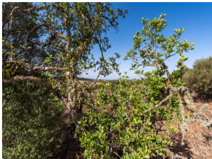
Amazing plot with building license