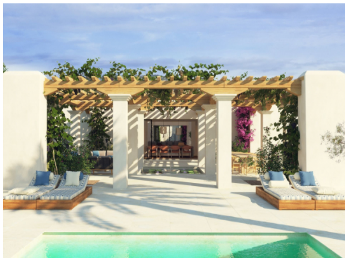
Plot with project