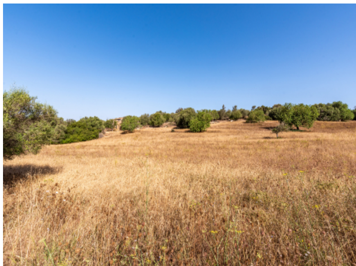
Amazing plot with building license