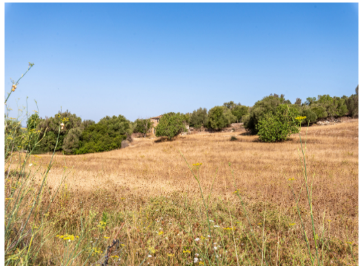
Amazing plot with building license