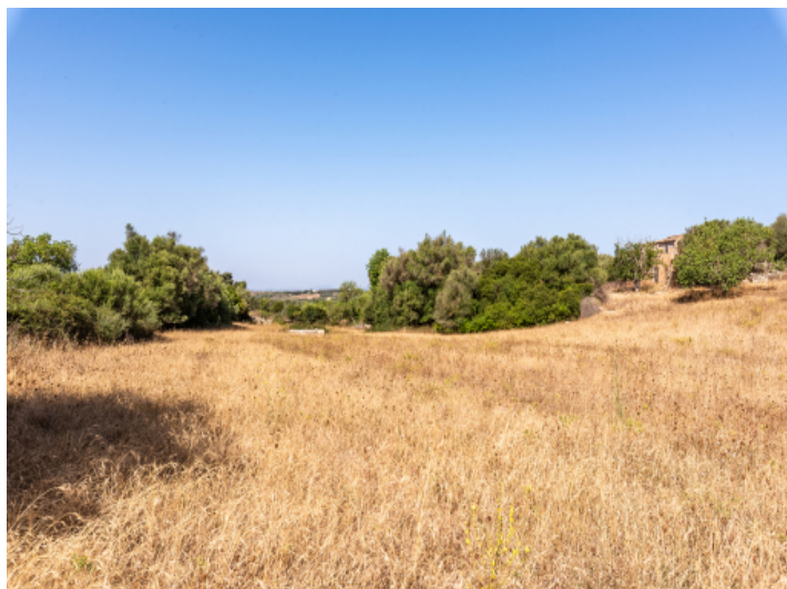
Amazing plot with building license