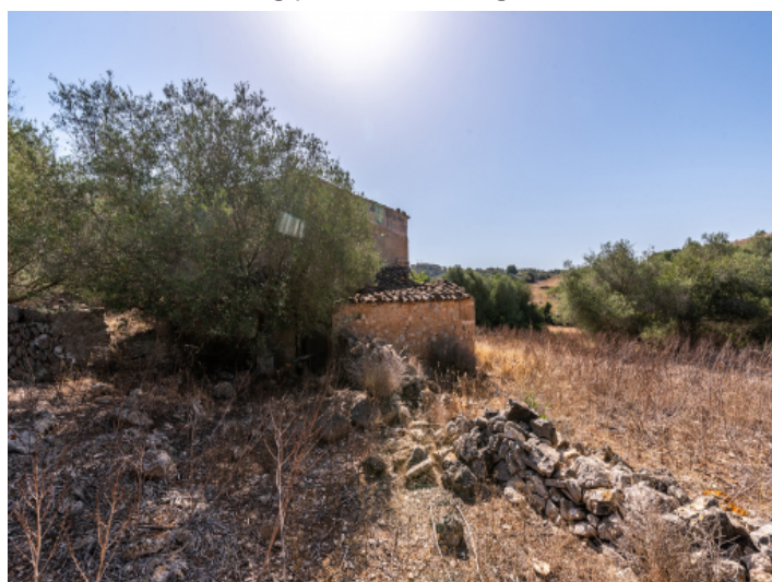
Amazing plot with building license