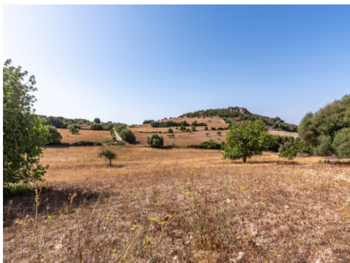
Amazing plot with building license