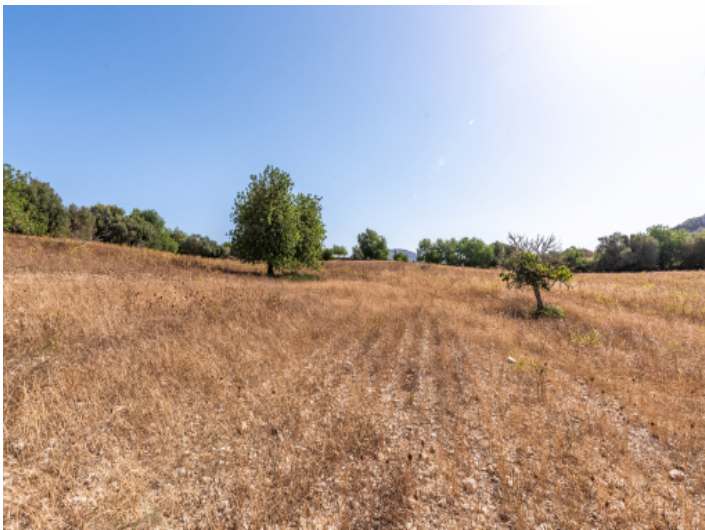
Amazing plot with building license