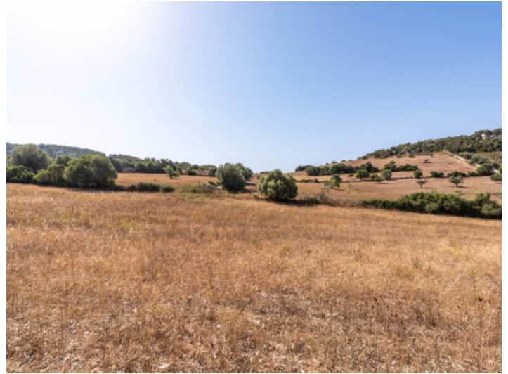
Amazing plot with building license