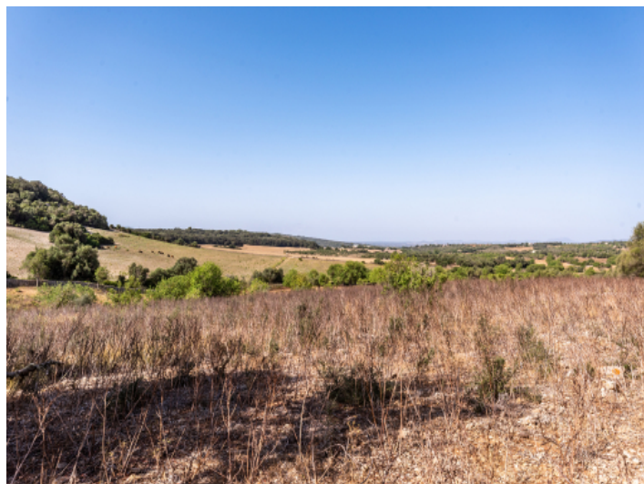
Plot with extensive views