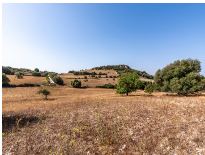
Amazing plot with building license