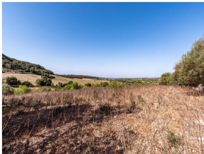
Amazing plot with building license