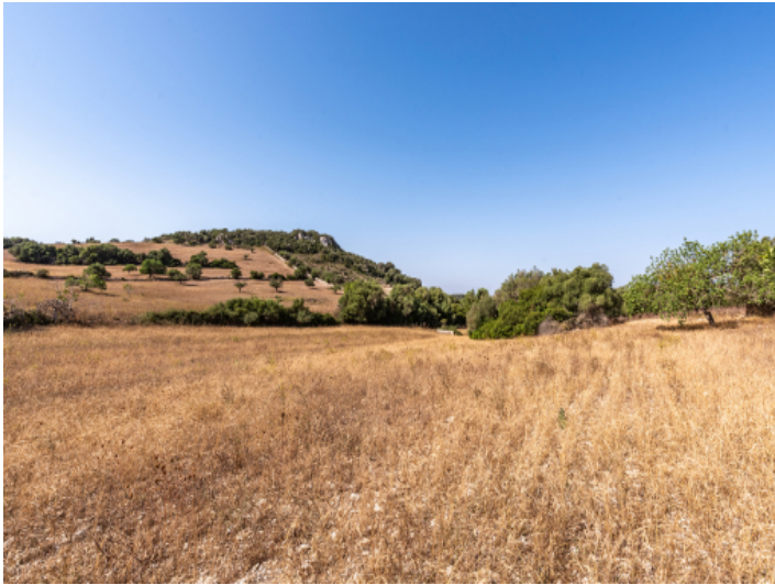
Amazing plot with building license