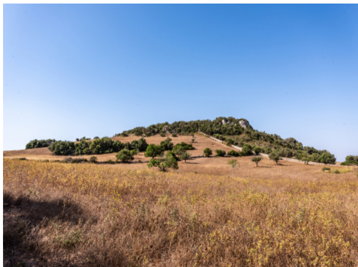
Amazing plot with building license