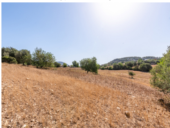
Amazing plot with building license