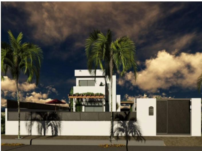
Views from the street