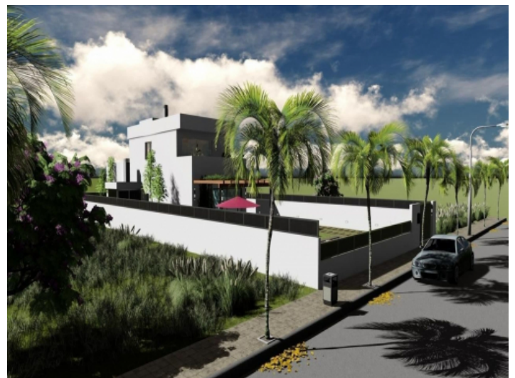
Views from the street