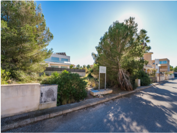
Street views to the plot