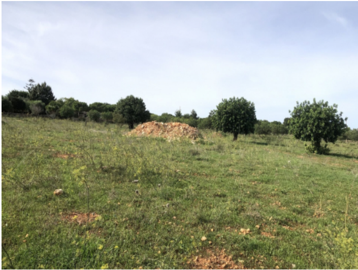
plot, Son Carrio