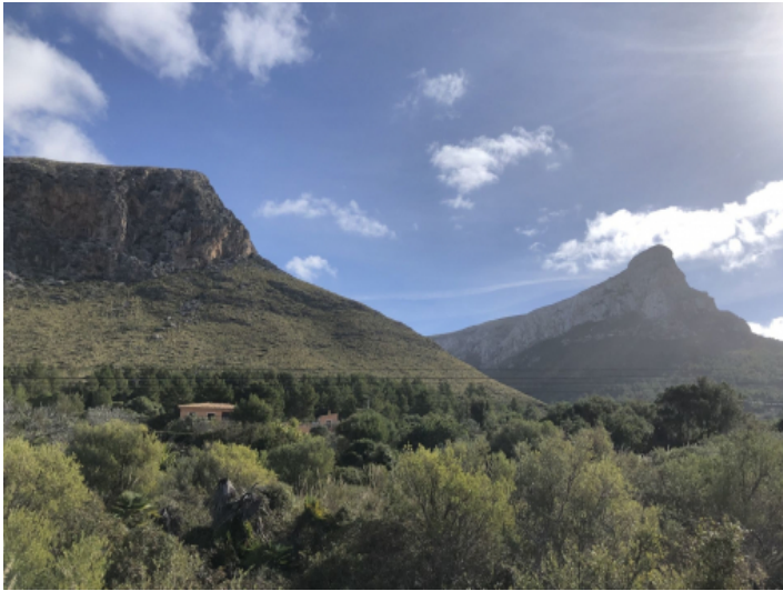
Beautiful nature is surrounding the plot