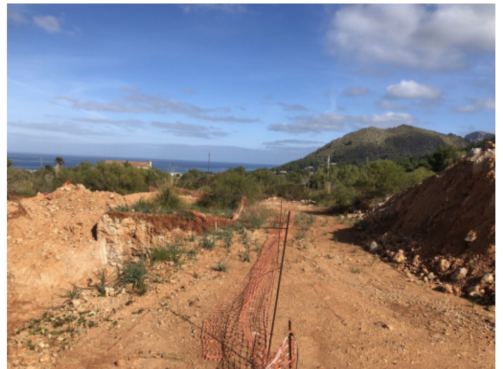
Colonia St. pere is close to Artá