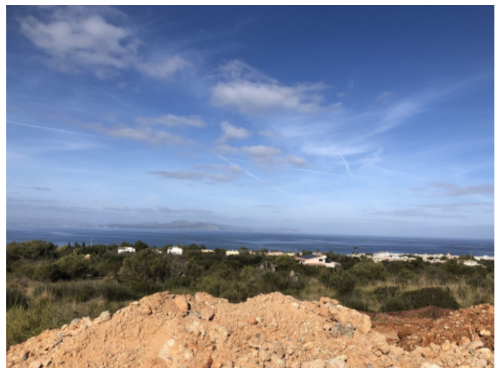
Views over Colonia St. pere up to the sea