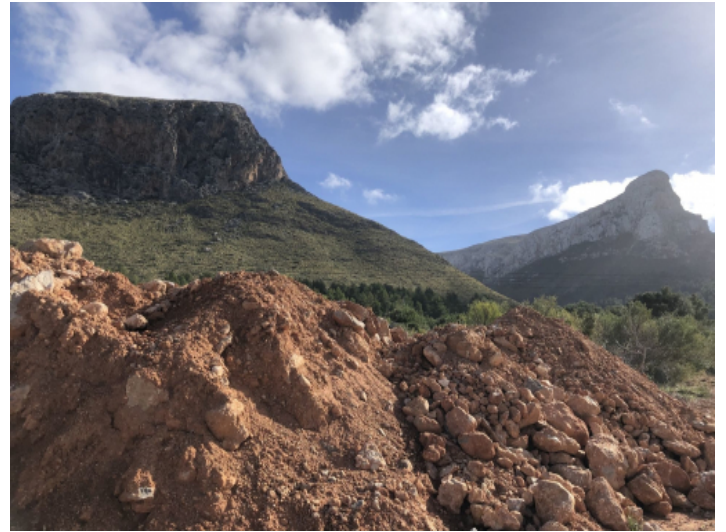
You can built a family home