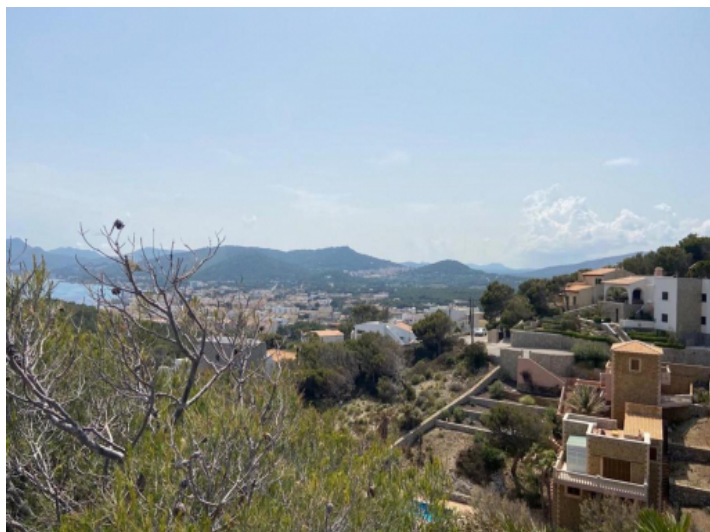
Construction plot with a view in Capdepera