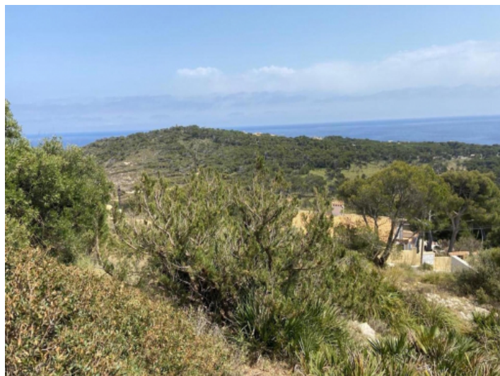
View of the plot