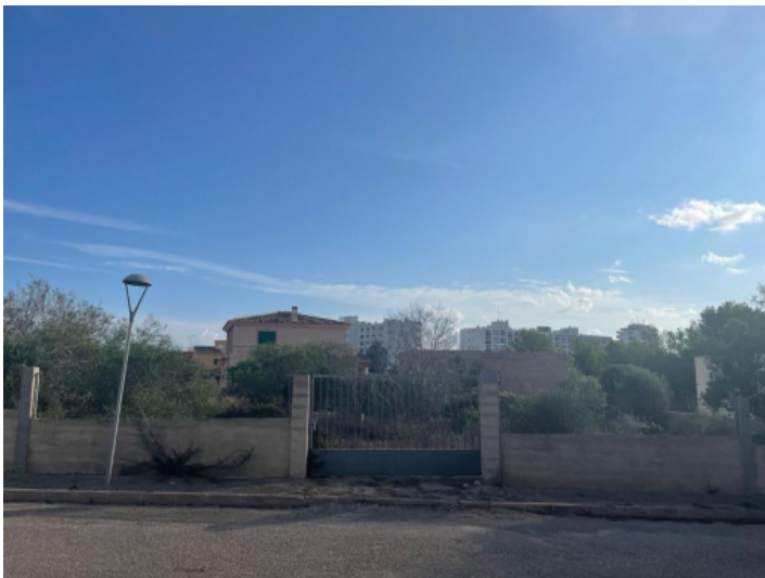
Access to the plot