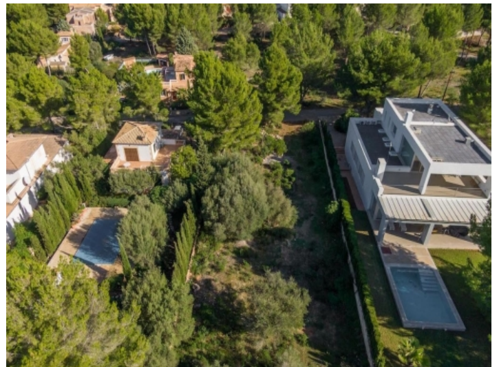
Bird's eye view