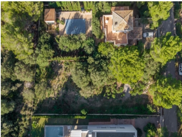
Bird's eye view