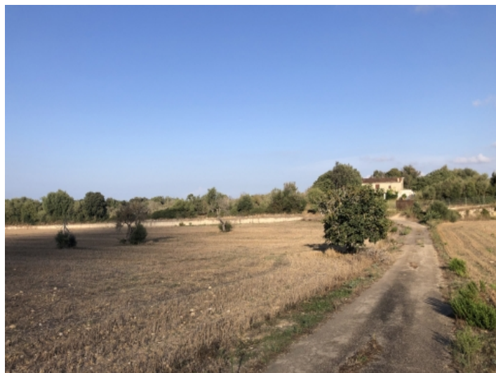
View of the plot