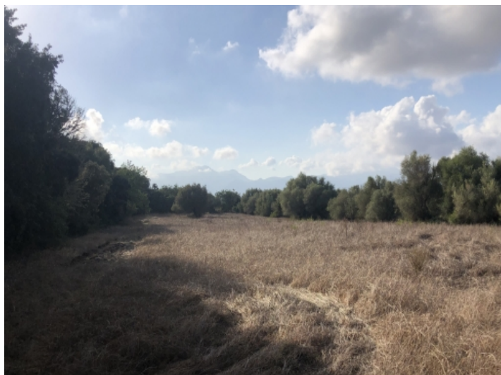
View of the plot