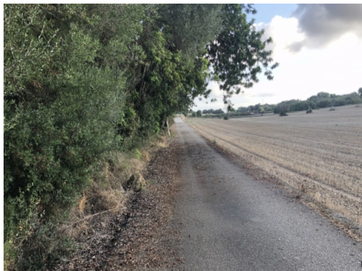
View from the street