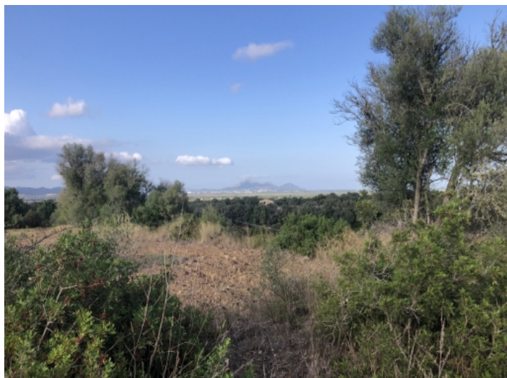
View of the plot