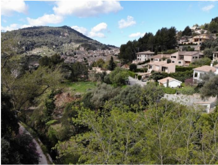
Dreamlike views to the town