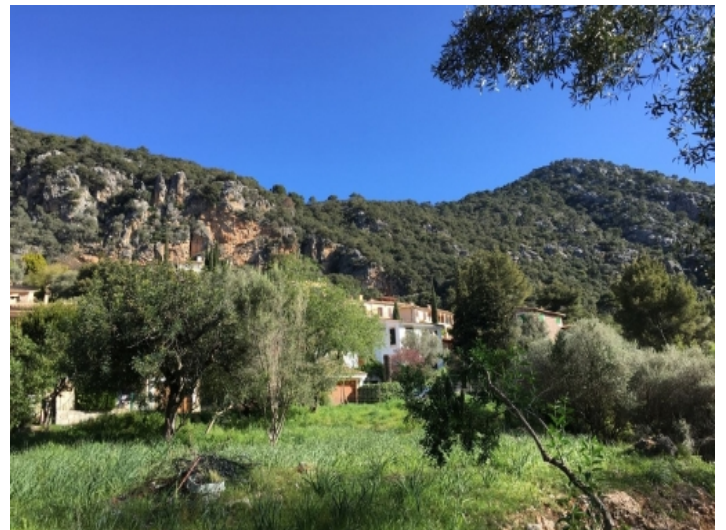
North facing view of the plot