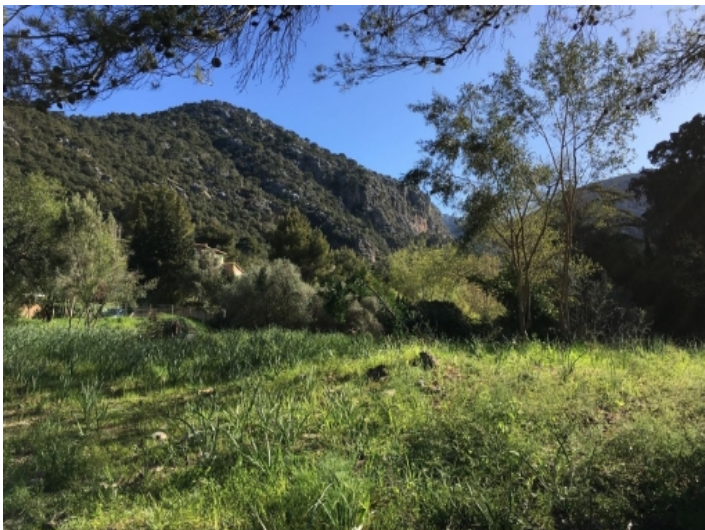
East facing view of the plot