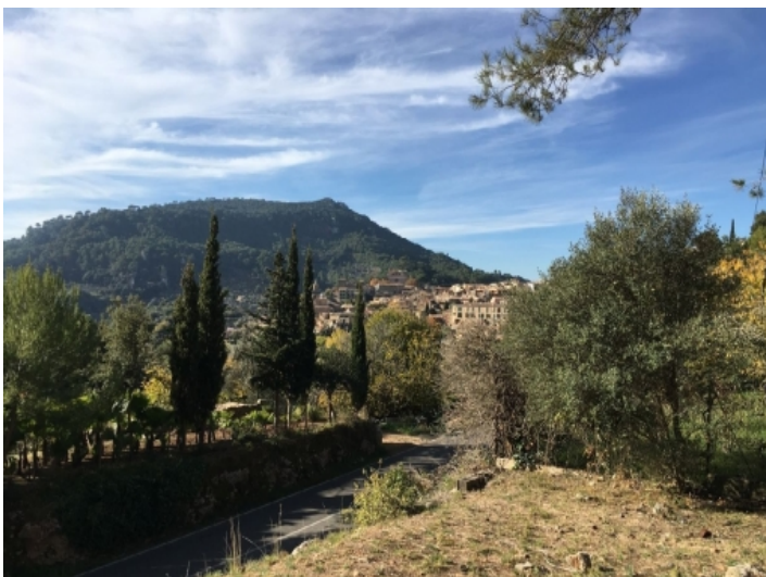
West facing view of the plot