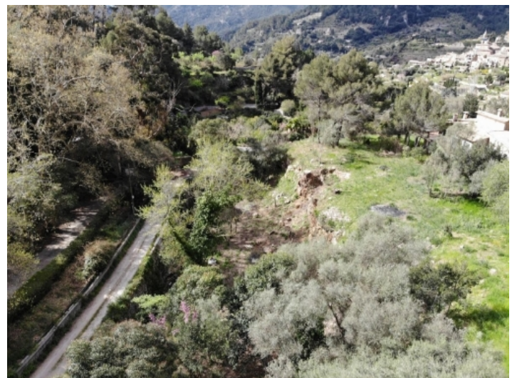
West facing view of the plot