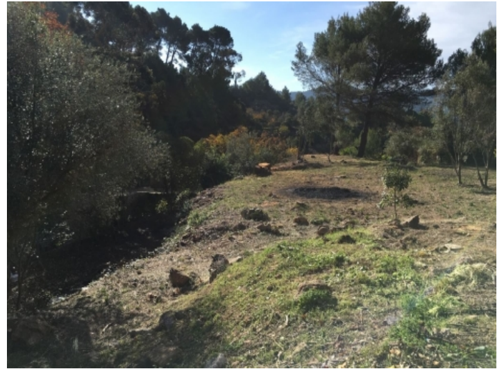
South facing view of the plot