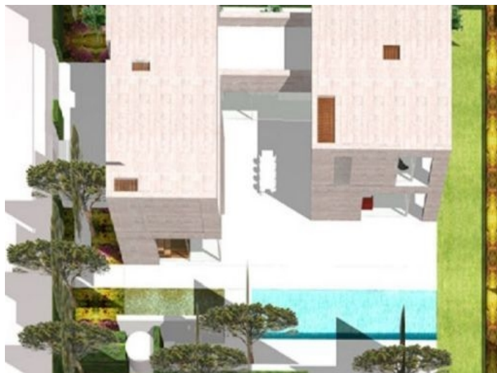
Alternative view of the project