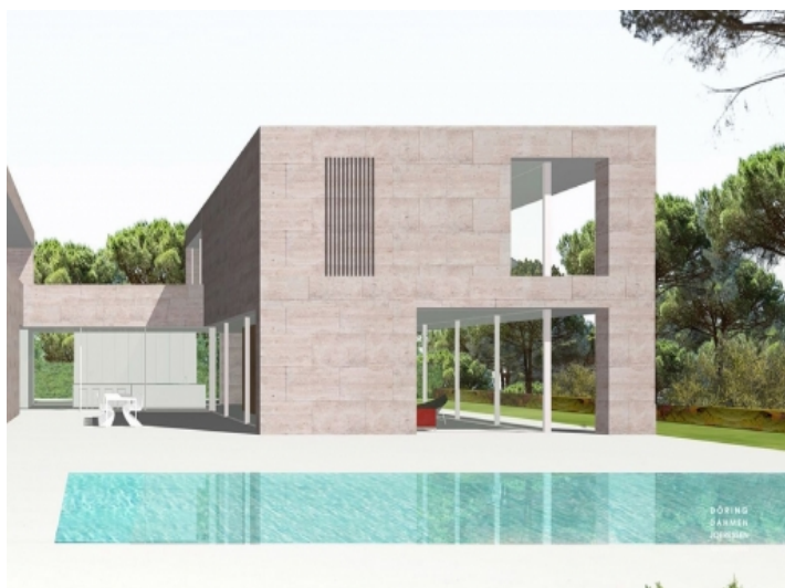
Plan of the villa