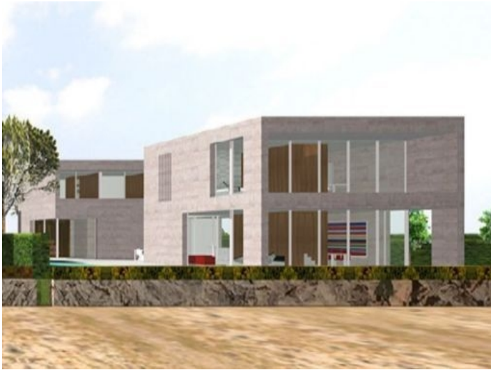
Alternative view of the project