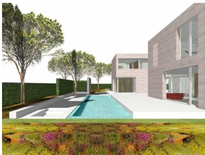
Alternative view of the project