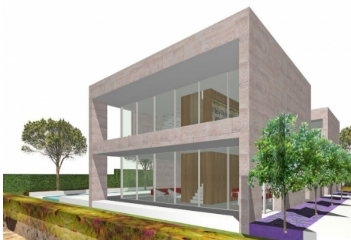
View of the project