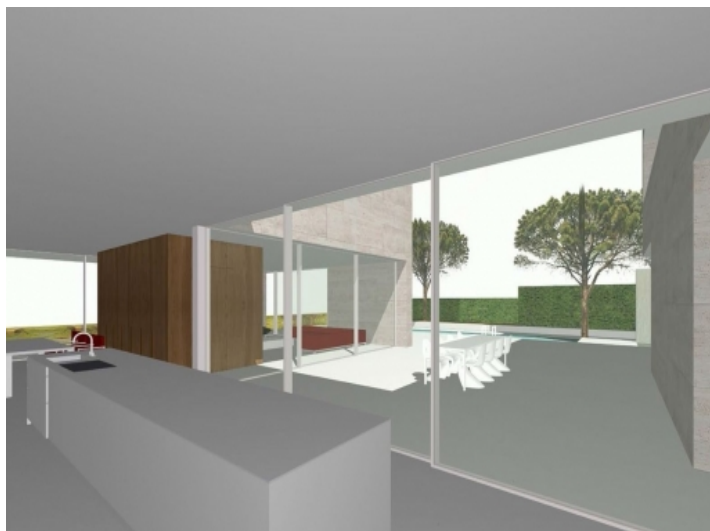
Alternative view of the project