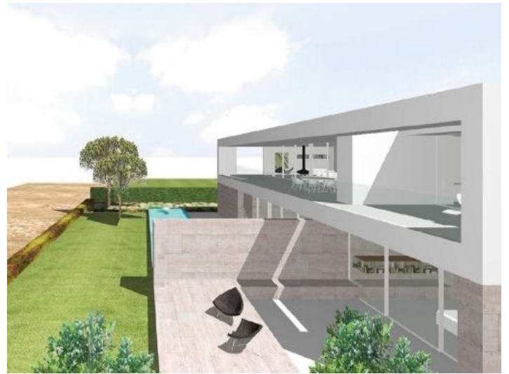
Plan of the project