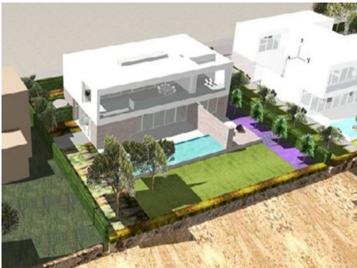
Alternative view of the project