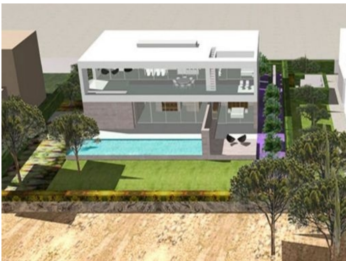
Alternative view of the project