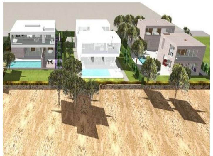
Alternative view of the project