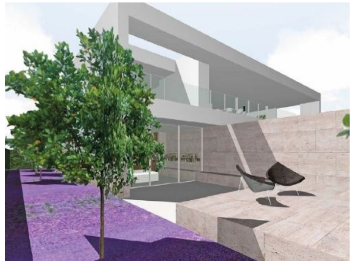
Alternative view of the project