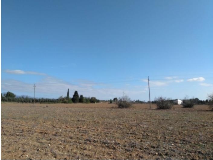
The plot is about 114.000 sqm