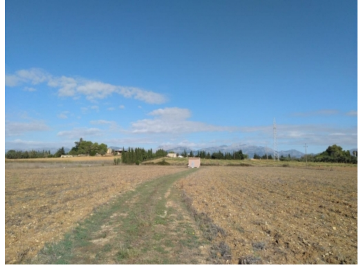
Nice mountain view