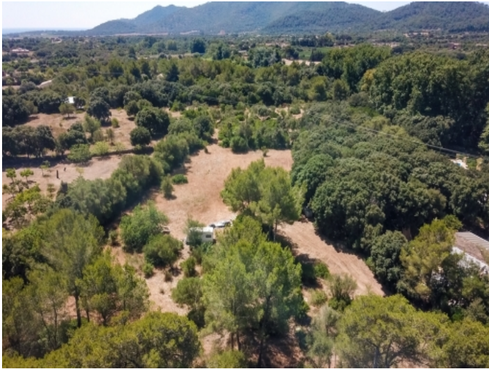
The plot measures 16.135 sqm