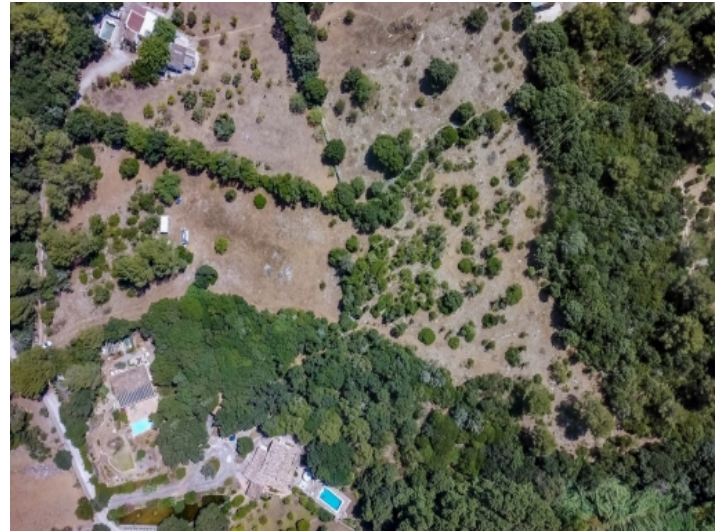
The plot from a birds-eye view