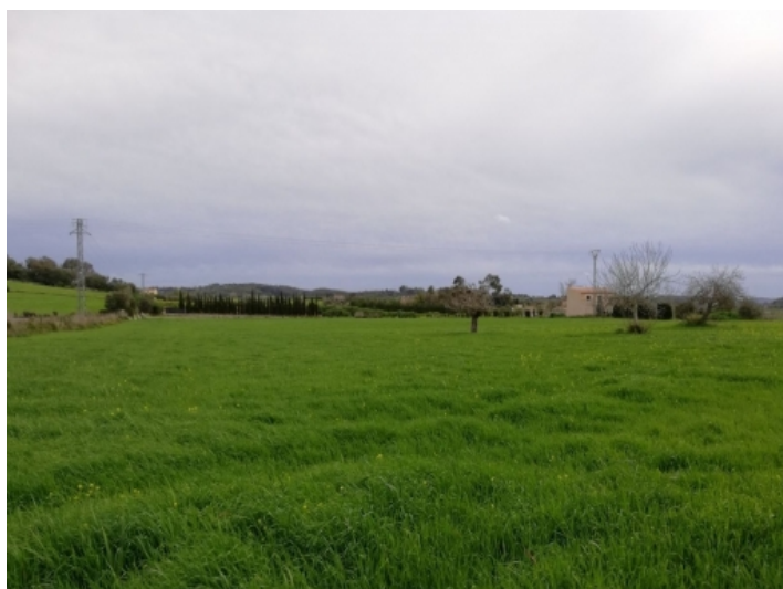
The plot has a size of 15.112,00 sqm