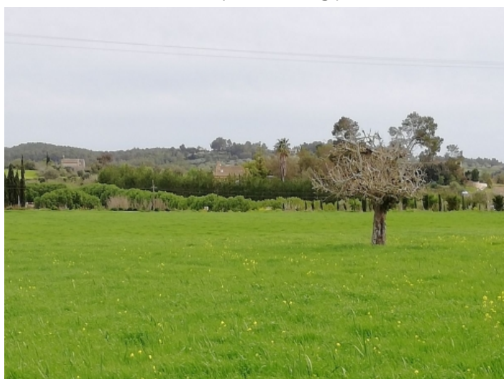
The plot is situated in a picturesque landscape