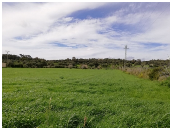
The building plot offers beautiful sweeping views