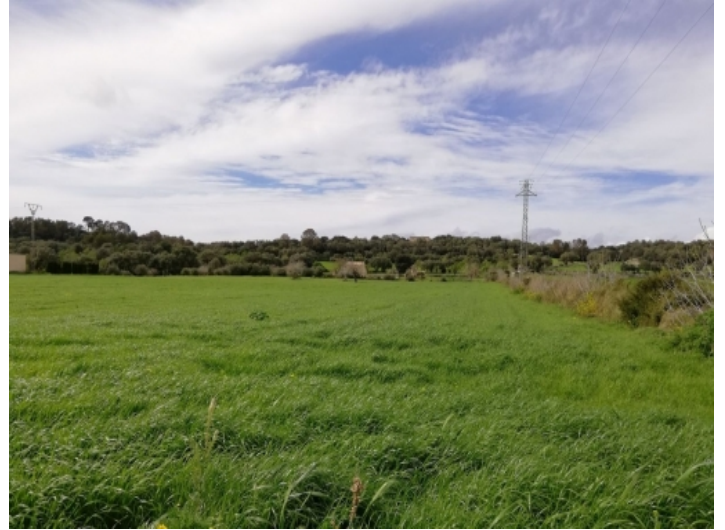
The building plot offers beautiful sweeping views