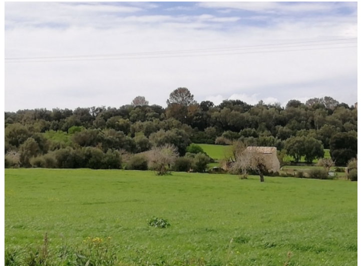
The plot is surrounded by nature