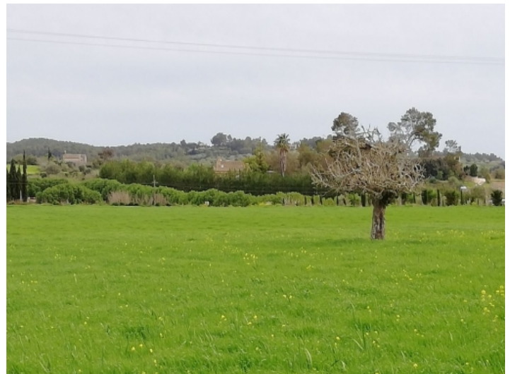
The plot is situated in a picturesque landscape