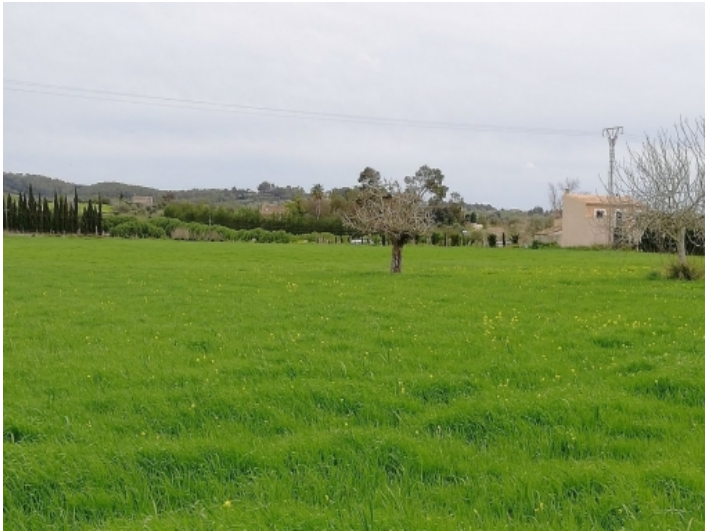
Flat and square building plot