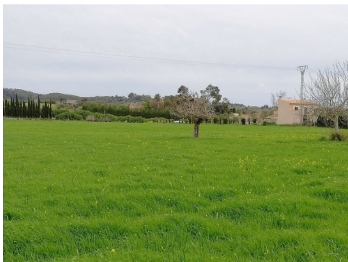
Flat and square building plot