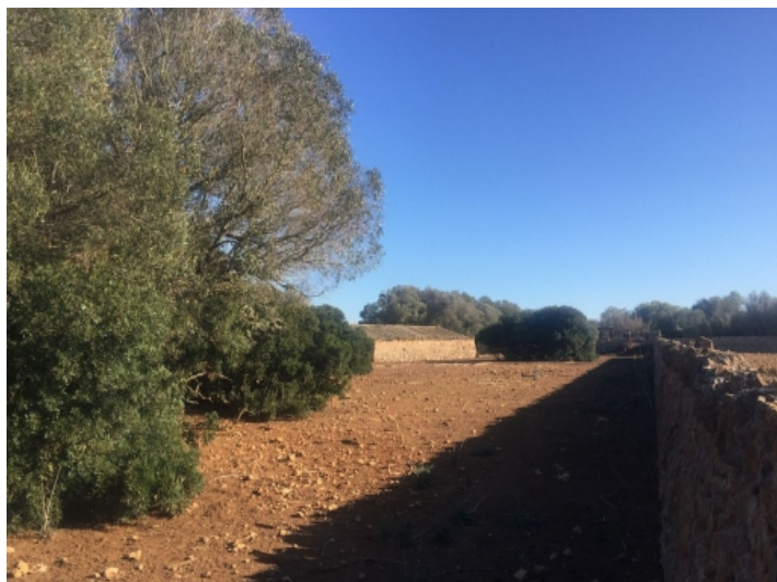
Natural stone wall