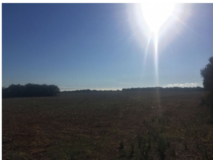
The plot has a size of 206,000 sqm