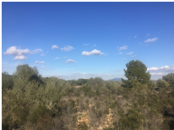
Sweeping views over the countryside