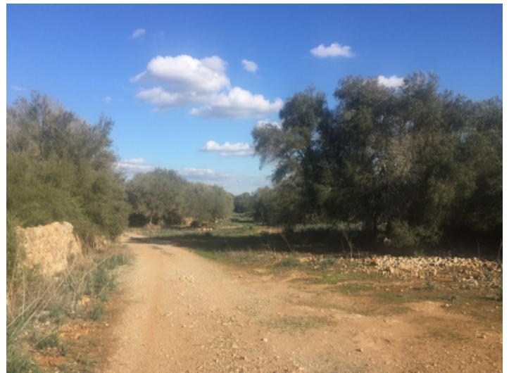
Way to the plot