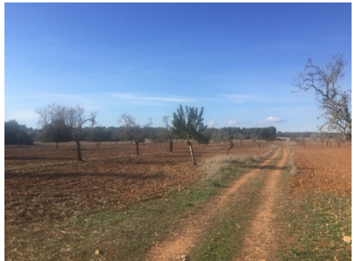
Perfect place for tranquility and relaxation