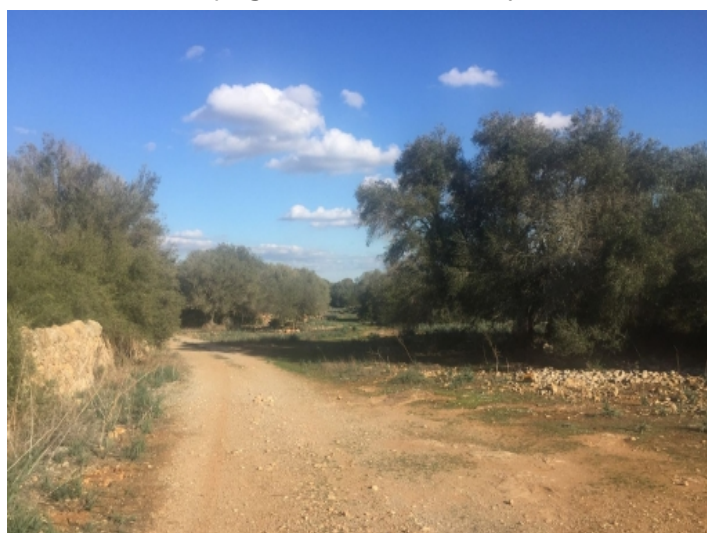
Way to the plot