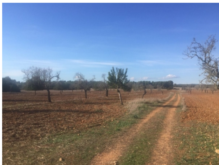
Perfect place for tranquility and relaxation