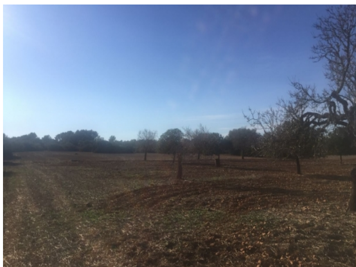
The plot is flat