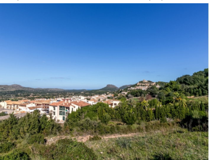
Wonderful views over the mountains and the castle of Capdepera