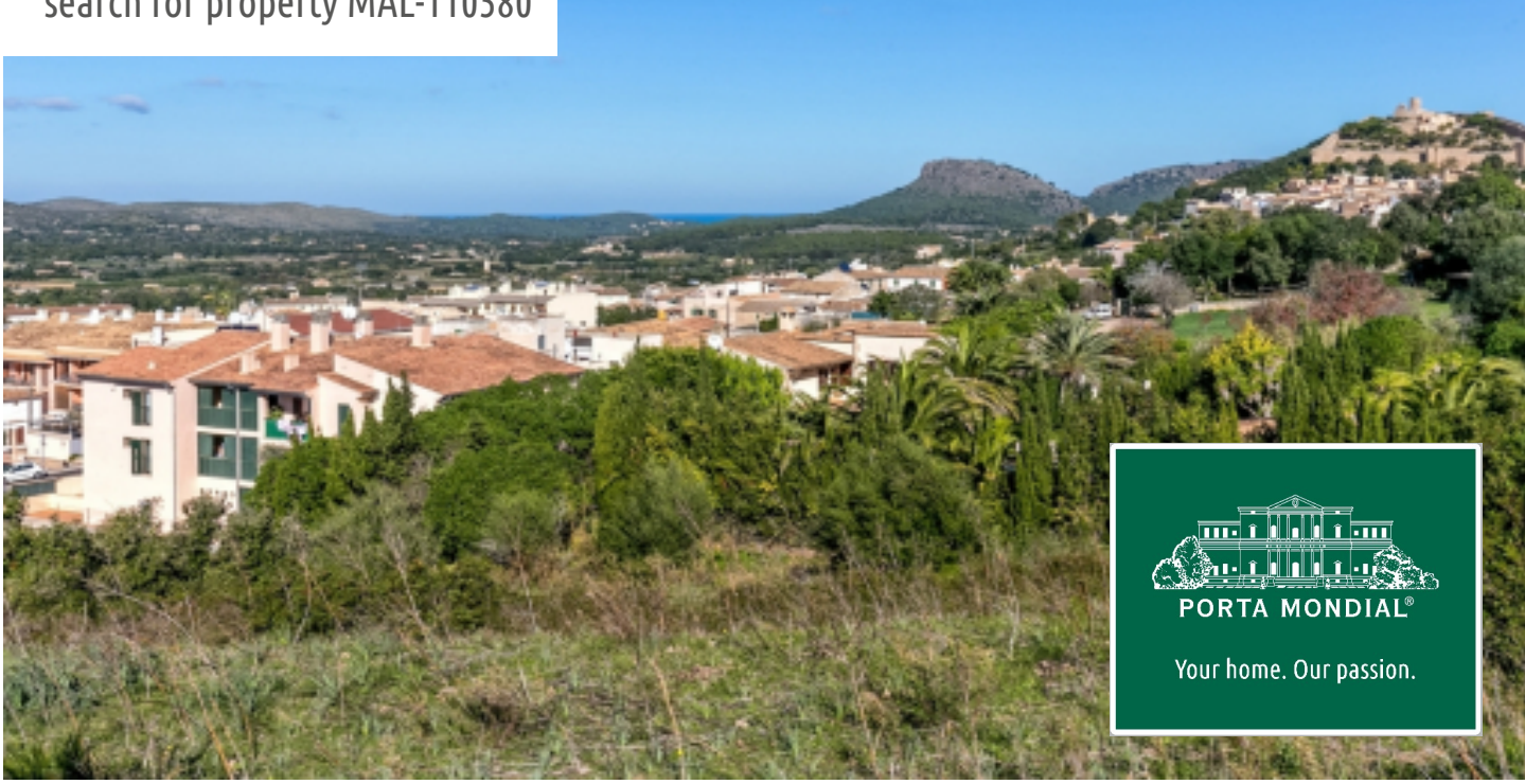
Beautiful building plot between Capdepera and Cala Ratjada