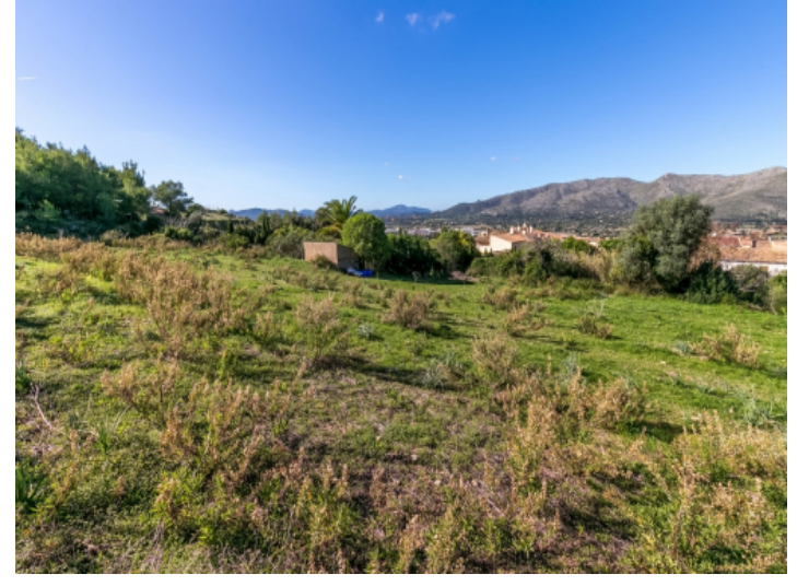
The building plot has a size of 32.625 sqm