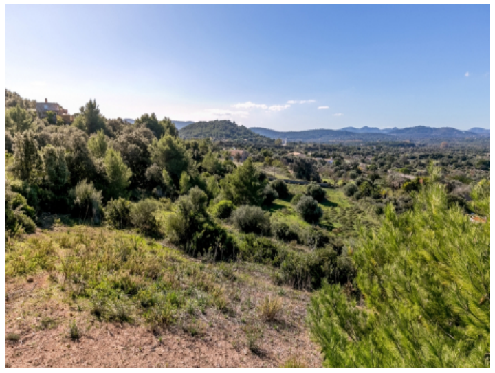
Lovely, hilly landscape