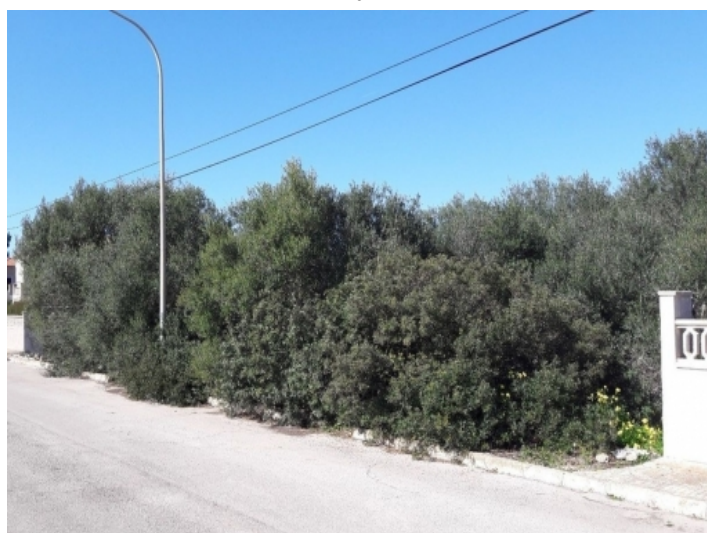
Street view of the plot