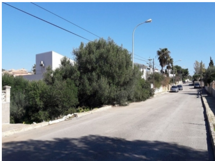
In a neat and quiet residential area