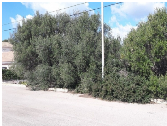
construction of a two-storey detached house is allowed