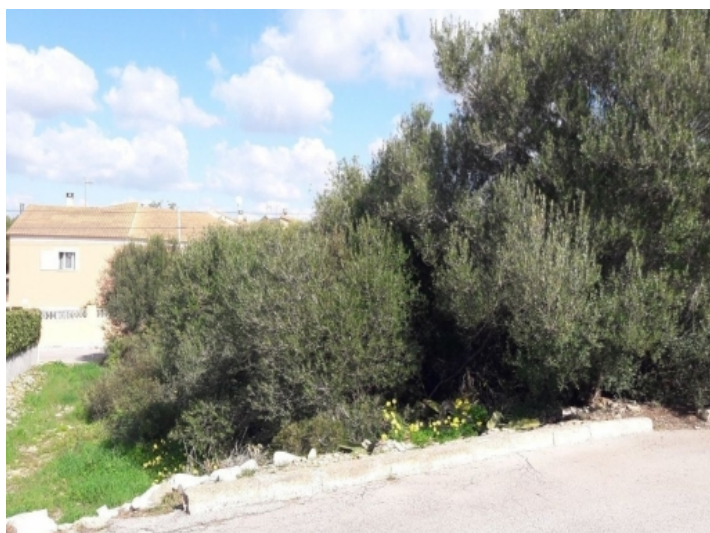
All main connections area already present