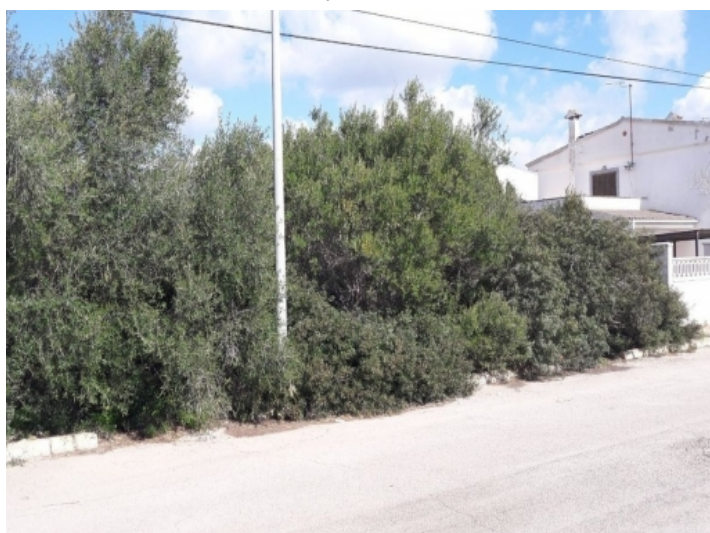
Approx. 300 sqm can be constructed