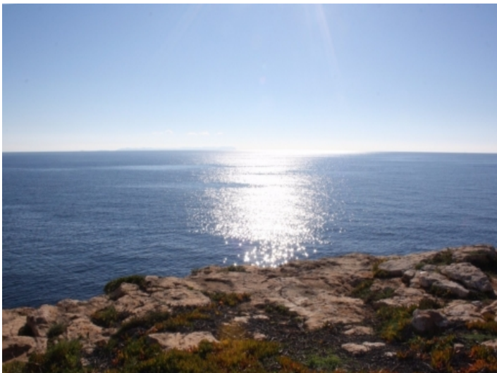
Sunny sea views