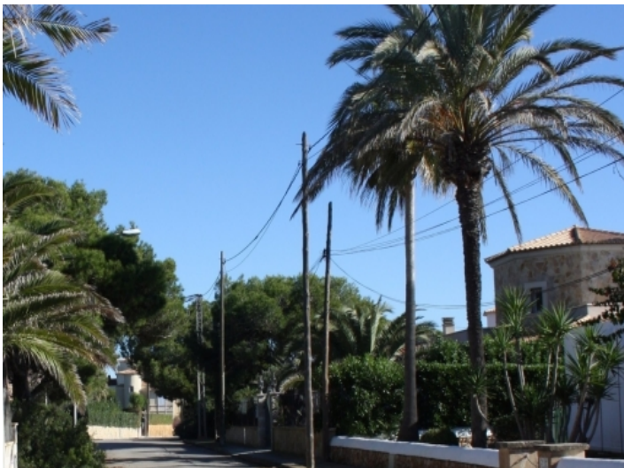
Views to the street