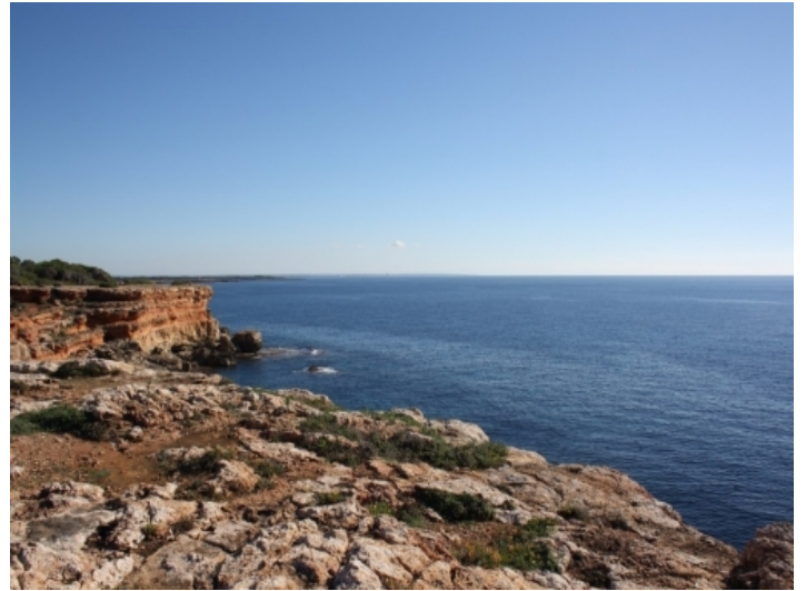
Mediterran sea views