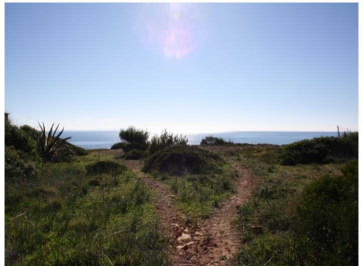
Views over the plot