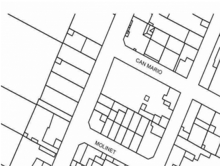
Views to the plot