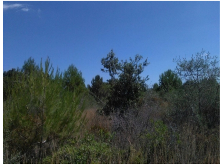
Plot in Son Servera