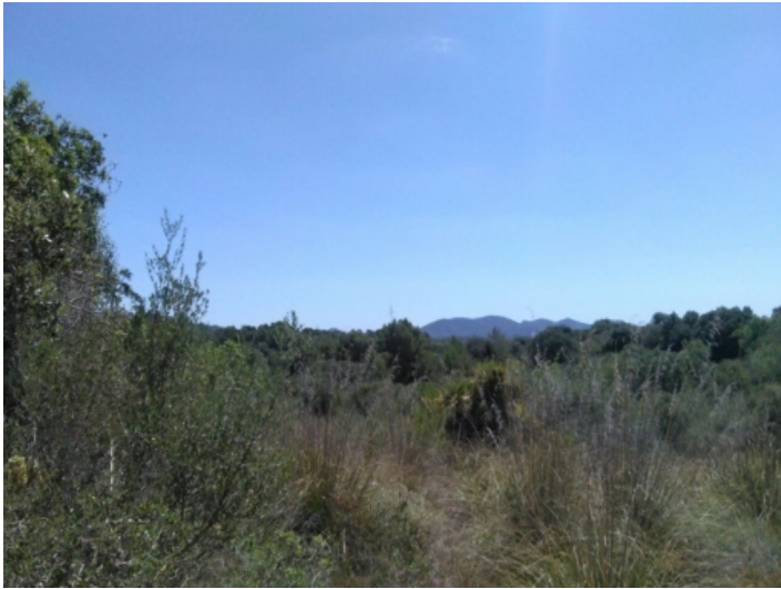
Plot with a lot of possibilities