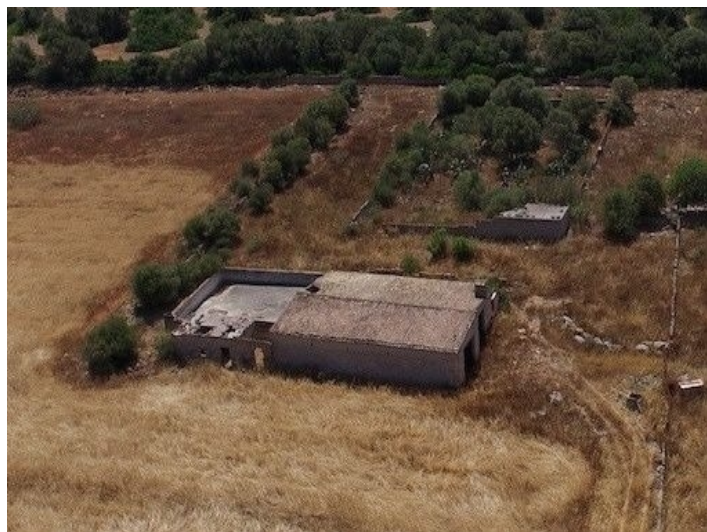
Small house on the plot