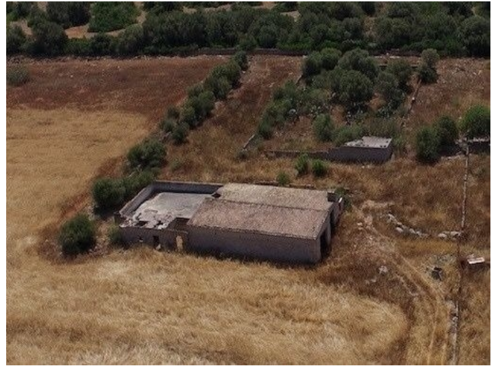
Small house on the plot