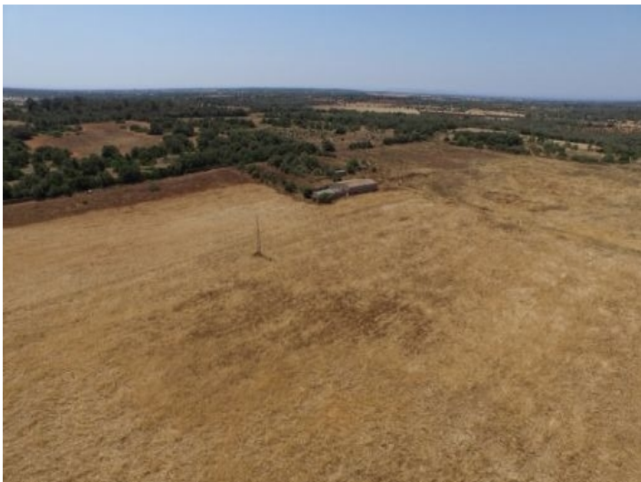
Impressive views to the plot