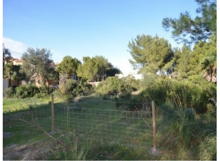
Spacious plot of 740 sqm