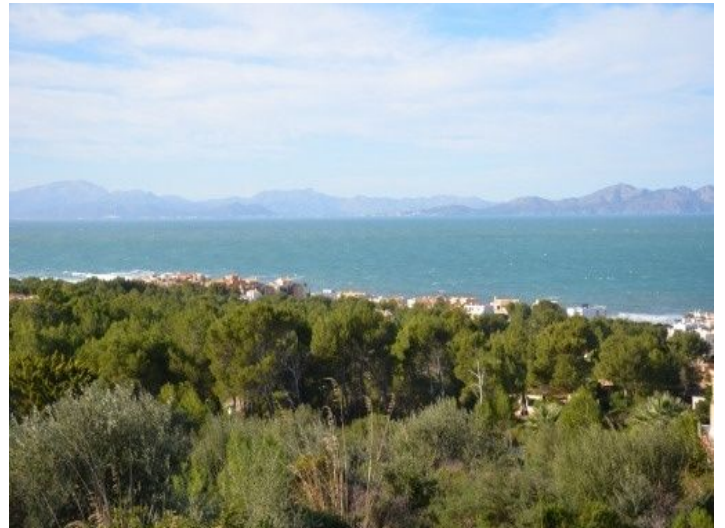
Stunning sea views