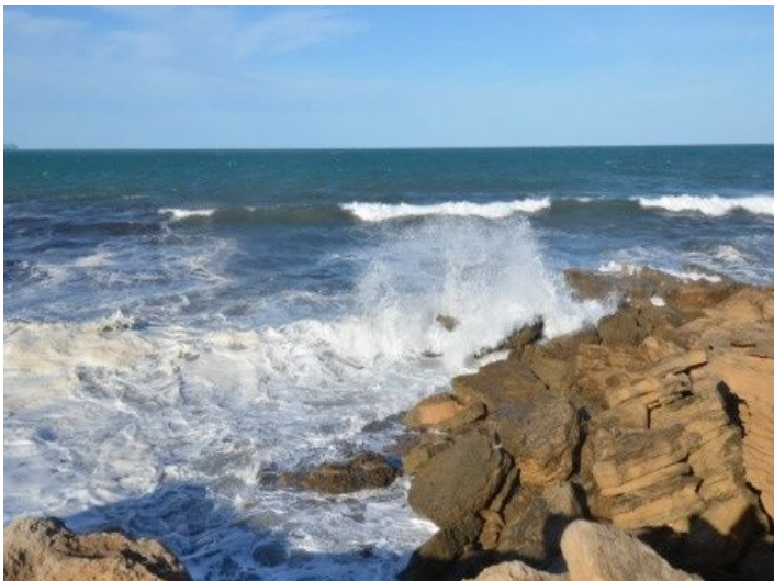
Near to the sea