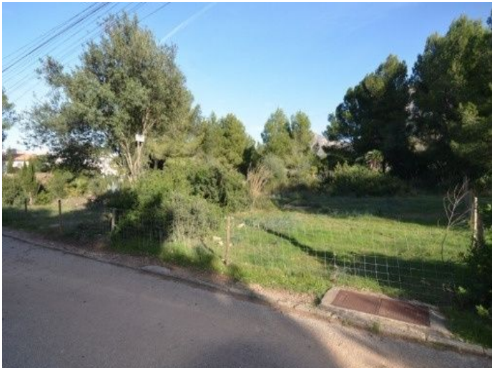
View from the street