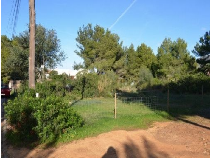
Plot in residential area